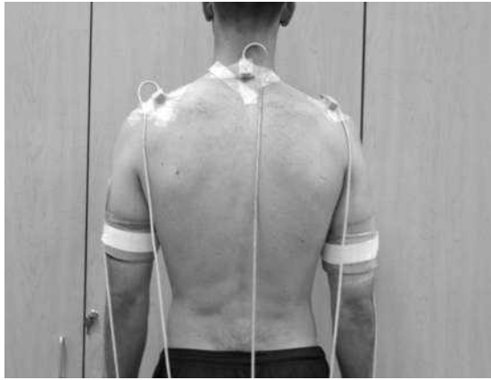
Figure 2. Scapular posture assessment using electromagnetic tracking device.

the transmitter, because it was determined previously in our laboratory 19 that this region of the measurement space demonstrated the least amount of position (0.7 mm) and orientation (0.27°) error. Additionally, reliability and precision for scapulohumeral motion had been established by our laboratory as an intrasession intraclass correlation coefficient of .967 with 0.94° of error and intersession value of .889 with 2.11° of error. 19