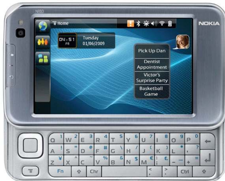
Figure 1. Homescreen on the N810 with the navigation butler on the right-hand side of the screen. The four events listed are gathered from the user's personal calendars. Clicking on them brings up a map to the event that was automatically extracted by the butler.

expedite simple tasks (e.g., finding directions) that are often cumbersome on a mobile device. The gathered information is packaged together and passively displayed onscreen in order to create a glanceable view. We imagine that a user would have a suite of butlers that he could activate, each one specialized for gathering a specific type of information. The butlers would gather information in the background incorporating the user's personal data (e.g., email, calendar, web history) and contextual information.