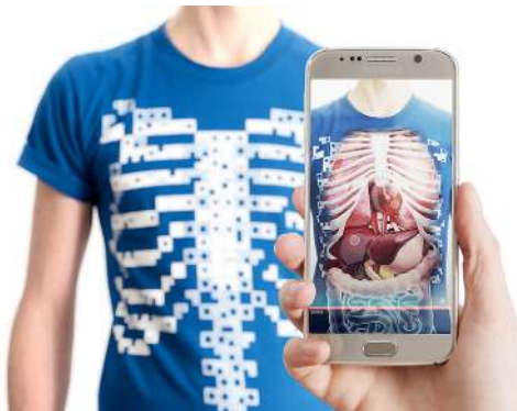
Figure 5 Curiscope T-shirt with visualisation of animated internal organs.

Available online: http://www.asvide.com/articles/1271