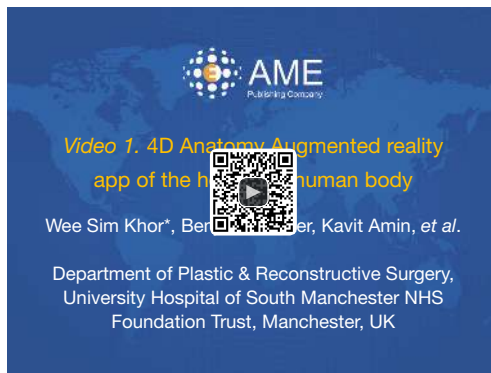
Figure 4 4D Anatomy Augmented reality app of the heart and human body (22).

Available online: http://www.asvide.com/articles/1271