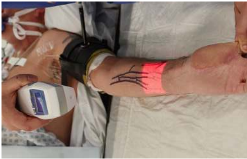
Figure 1 Use of Accuvein to image veins on patient.