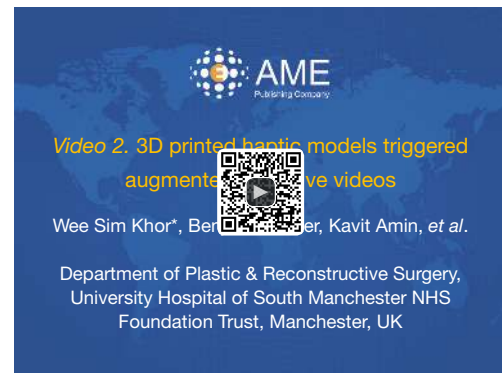
Figure 6 3D printed haptic models triggered augmented operative videos (34).

the simulated environments still fall short graphically from augmented images. According to the Lancet Commission on Global Surgery, 5 billion people do not have access to safe affordable surgery (30). Live operations using AR, have been broadcast to a global community with feasibility demonstrated for basic procedures both in Paraguay and Brazil (31). Virtual interactive presence and augmented reality (VIPAR) has developed a support solution that would allow a remote surgeon to project their hands into the display of another surgeon wearing a headset (32). Proximie is another platform that aims to introduce AR technology to surgeons in the developing world that will allow them to visualise real-time or recorded operations being performed by experts in other parts of the world, allowing for a breadth of surgical experience to be disseminated. Both complex visual and verbal communication enable long-distance intra-operative guidance (33). It is possible to