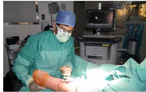
Figure 2 Use of Google Glass in theatre.