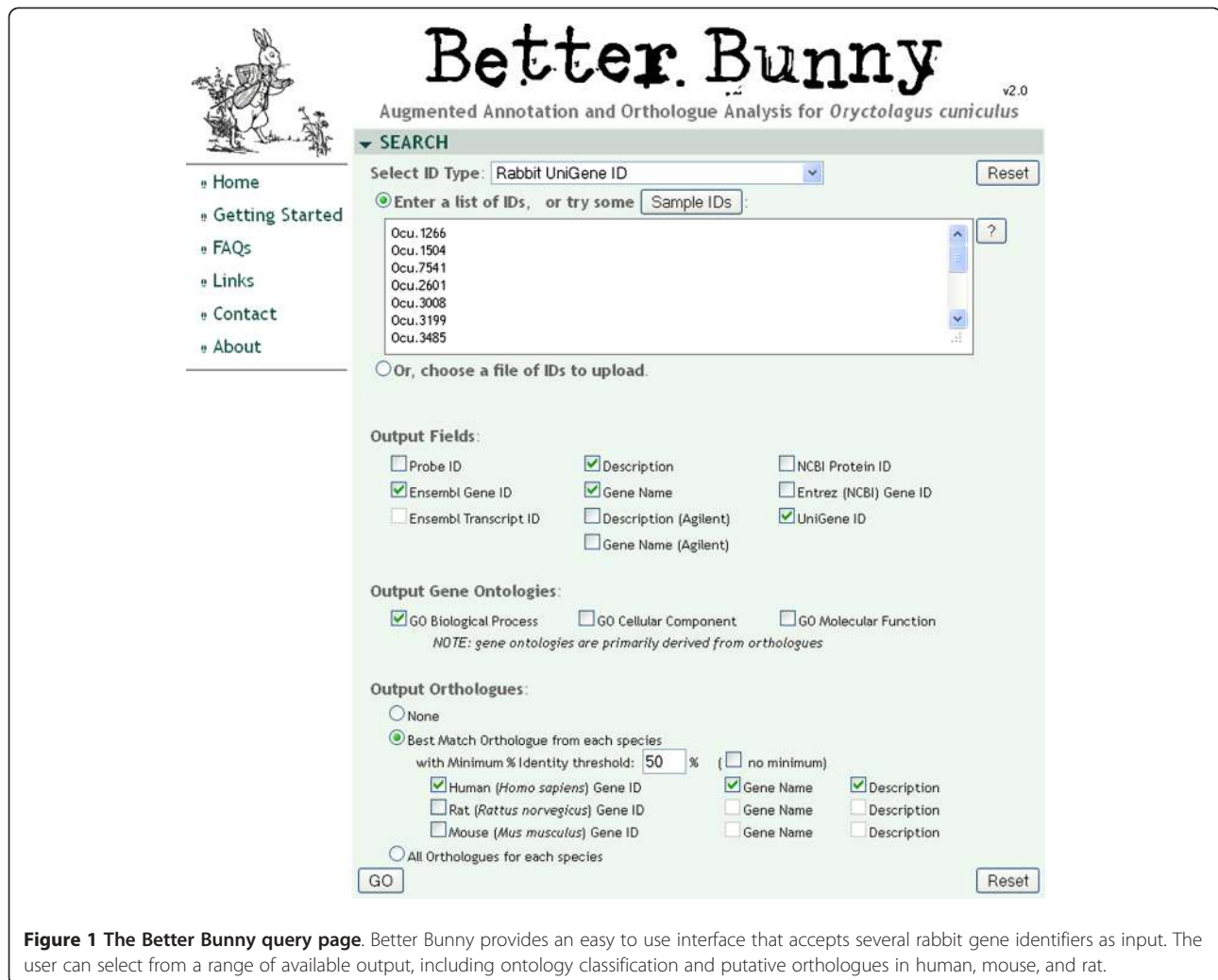
Figure 1 The Better Bunny query page. Better Bunny provides an easy to use interface that accepts several rabbit gene identifiers as input. The user can select from a range of available output, including ontology classification and putative orthologues in human, mouse, and rat.

investigators to perform functional annotation that may otherwise be unavailable. Orthologues can be selected from human, mouse, and rat. The orthologous relationships in Better Bunny are derived from Ensembl and are based on protein sequence similarity. Ensembl employs an automated orthologue identification pipeline that performs pairwise alignments (BLASTP) between all pairs of proteins for all available species [15]. The alignment is performed using the longest protein translation for each gene, and the percent identity displayed in Better Bunny is the value relative to the target (non-rabbit) species. Functional annotation transfer based on sequence similarity is widely used to establish putative function for poorly characterized proteins. While high sequence similarity is not a guarantee of similar function, studies have demonstrated that a threshold of 50-60 % identity ensures a high probability of similar function at the enzyme and gene ontology levels [16]. Better Bunny allows users to specify a minimum required percent identity for the selection of orthologues. An individual rabbit gene