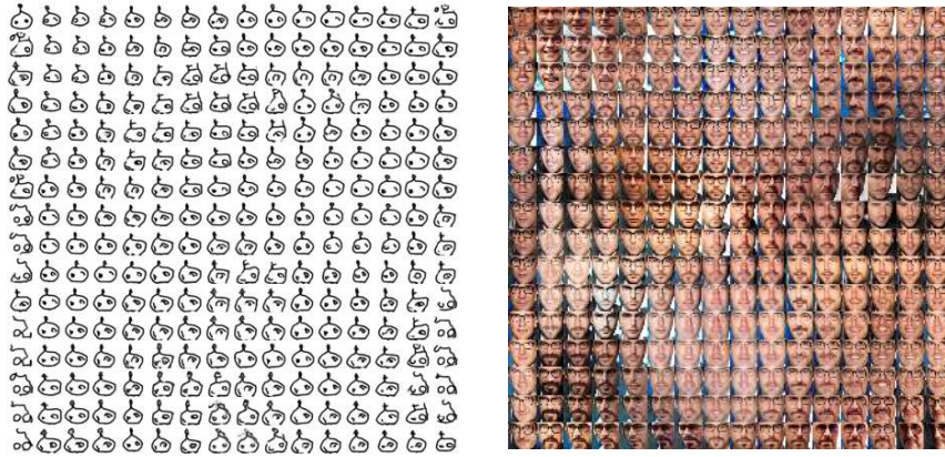
Fig. 2. An Interpolated spherical subspace[43] of the GAN generation space on Omniglot and VGG-Face respectively. The only real image ( x_i^c ) in each figure is the one in the top-left corner, the rest are generated to augment that example using a DAGAN.