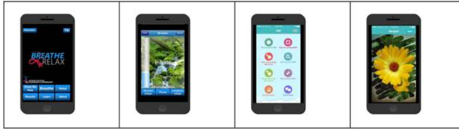
FIGURE 2 | Screenshots of Breathe2Relax (Left two) and Self-Help for Anxiety Management (Right two).

and discussion yielded consensus around 7 broad themes: ease of use, educational value, role in self-monitoring and enhancing self-awareness, relaxation/mindfulness, ability to incorporate into daily life, data and security concerns, and value of staff role in encouraging engagement with mental health apps.