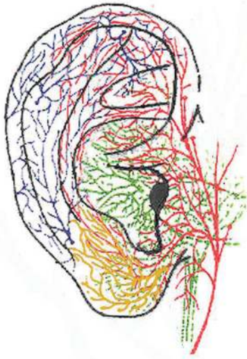
FIGURE 1: The innervations of the external auricle. The innervations of the auricular branch of the vagus nerve are marked by green color. The innervations of the auriculotemporal nerve are marked by red color. The innervations of the lesser occipital nerve are marked by blue color. The innervations of the greater auricular nerve are marked by yellow color.

and depressor response, induced by stimulations including cerumen crumming in auditory canal or auricular concha [23, 24]. Engel [25] groups together eight reflexes including gastroauricular phenomenon in man, auricular phenomenon in man, pulmoauricular phenomenon in man, auriculogenital reflex in cat, auriculouterine reflex in women, oculocardiac reflex in man, Kalchschmidt's reflex in cattle, and coughing attack with heartburn in man. According to the national standards of the location of auricular acupoints [26], auricular acupoints treating visceral diseases are mainly located at auricular concha (see Figure 2). Perhaps the ABVN forms a connection between the auricle and the autonomic regulations.