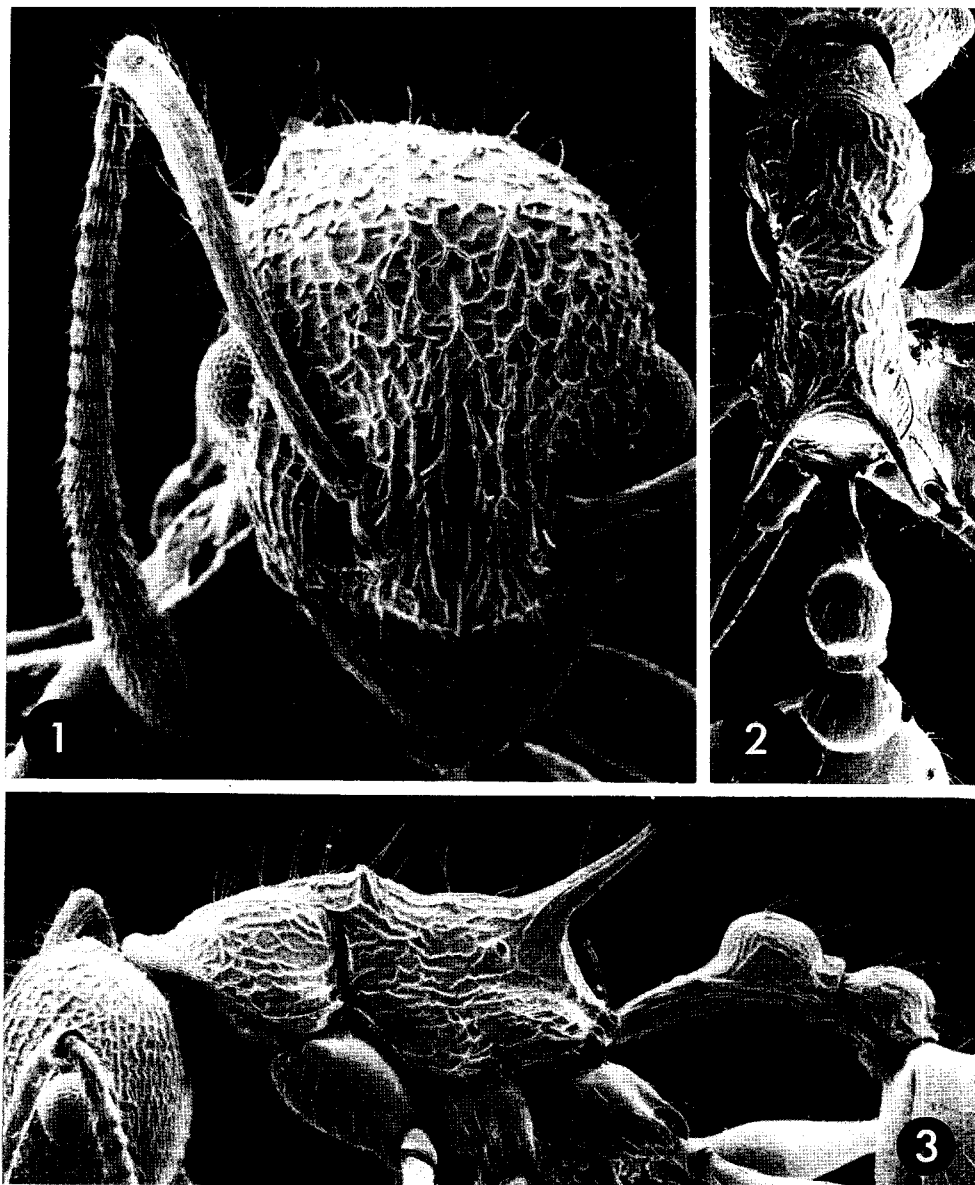
Figs 1–3. Leptothorax bilongrudi , holotype worker, standard views. HW 0.96 mm; PW 0.75 mm; AL 1.56 mm.

Dimensions (mm, holotype, smallest paratype, largest paratype (ranked by HW)): TL c. 4.5–6.2; HL 1.14, 0.98, 1.24; HW 0.96, 0.84, 1.24; CI 84, 86, 89; SL 1.16, 0.97, 1.27; SI 102, 99, 102; PW 0.75, 0.63, 0.83; AL 1.56, 1.34, 1.77. General features as in Figs 1–3. Mandibular dentition unusual for Leptothorax ; consisting of 3 apical and 2 basal teeth separated by a long, minutely