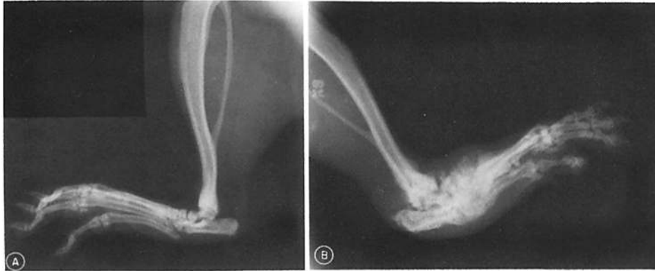
FIG. 3. Comparison of roentgenograph of normal rat hindpaw (A) with that (B) from a rat whose arthritis was induced by chick type II collagen in ICFA. Soft-tissue swelling, bone destruction and periosteal new bone formation are prominent 2 wk after the onset of inflammation.

Additional Attempts to Induce Arthritis. Primary and booster injection regimens employing 2.0 mg per rat of chick type I collagen, human type III collagen, or chick \alpha 1(\text{II}) chains in CFA failed to induce arthritis in a total of 50 additional rats. Also human type I tropocollagen which had been passed through DEAE in a manner identical to the preparative technique for type II collagen did not cause arthritis in 20 rats. No significant differences in the incidence of arthritis were found with doses of type II collagen ranging from 0.5 to 2.0 mg per rat.