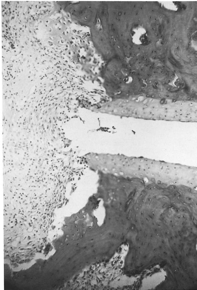
FIG. 2. Section of ankle joint taken approximately 2 wk after onset of type II collagen-induced arthritis. Synovial proliferation and intense infiltration by mononuclear cells is producing cartilage and bone erosion. Hematoxylin and eosin \times 200 .

and sections of the trachea showed no evidence of generalized cartilage inflammation. Likewise, histologic examinations of the skin, lung, and kidney were normal.