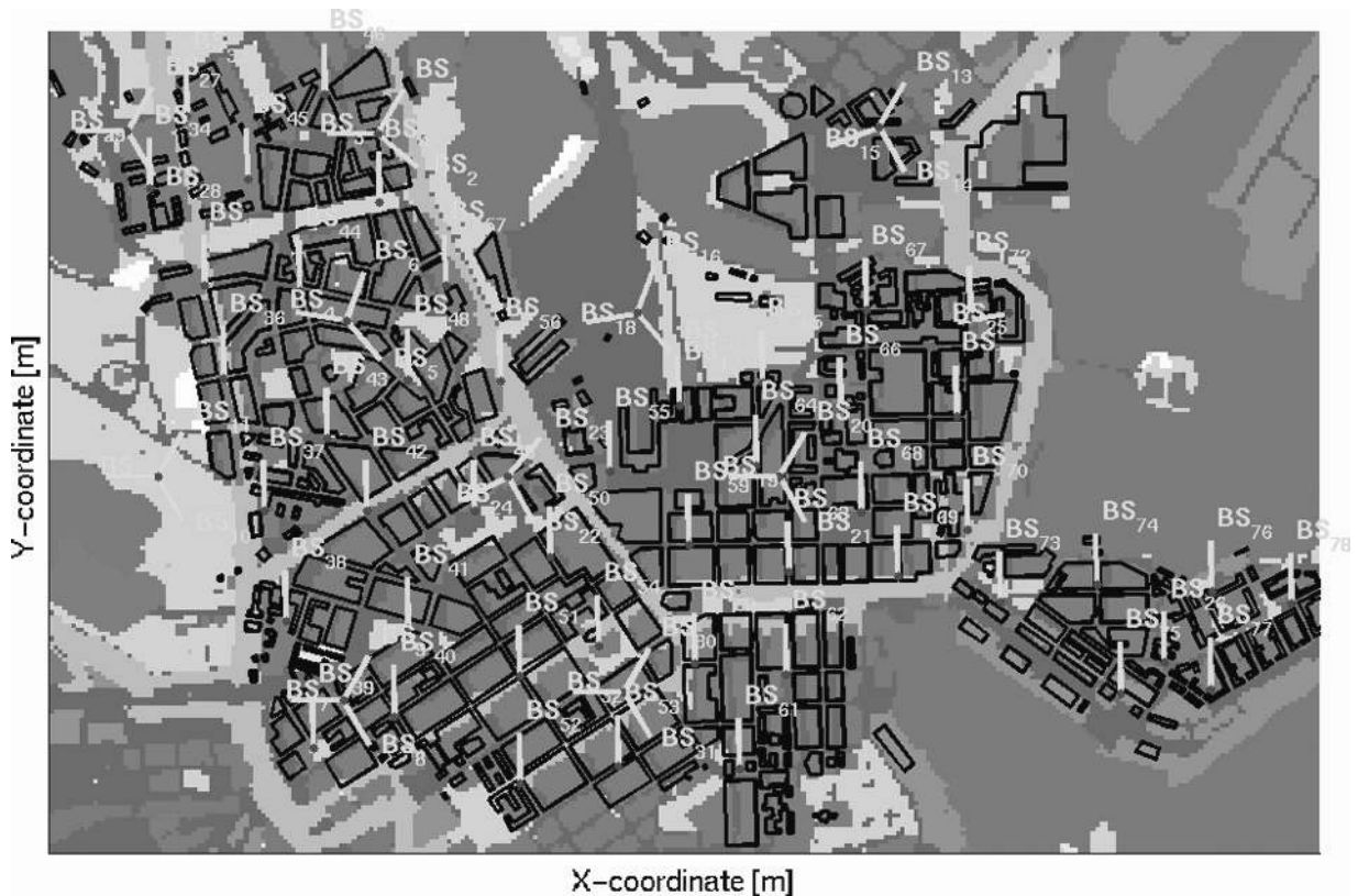
Fig. 4. Mixed micro and micro case with 32 macro cells and 46 micro cells deployed in Helsinki center area.

settings and in particular for cautiously made parameter settings. The results in Table II show that the auto-tuning improved the system performance. The UL throughput increased 48–57% compared with the conservative noise-rise target of 4 dB (60% loading), 16–25% compared with the 6-dB P_{rxTarget} (75% loading) and 2–10% compared with the 8-dB P_{rxTarget} (84% loading). The degradation in real-time call quality was minor, while the real-time call blocking decreased significantly [14].