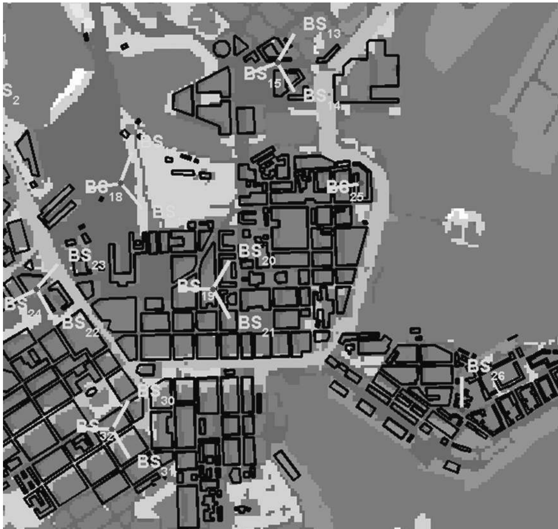
Fig. 3. The pure small macro cell scenario with five three-sector and two one-sector macro cell sites in Helsinki center area. Water areas are shown in blue. Average site distance roughly 910 m. Subset of 32-cell scenario in Reference [26].

and signal-to-interference ratios were recalculated for each connection in the DL. The method of Reference [10] was used to obtain the correctness of received frames from signal-to-interference ratios.