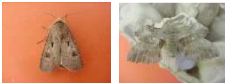
Figure 1. Images of (a) Agrotis exclamatoris (uniform background) and (b) Laothoe populi (poorer background).

Figure 1 gives examples of two images in the dataset. Figure 1(a) is most typical of images in the dataset, in which a moth has been photographed against a nearly uniform background (although the lighting is not uniform from left to right). Figure 2(b) is an example of an image taken against a non-uniform background, in which the colour of the moth is actually quite similar to the colour of the background, making this image difficult to segment. Due to the practical nature of the task (photographing live moths) it is not surprising that all of the images do not have clean, uniform backgrounds. In practice, it would be desirable for a classifier to automatically learn the difference between a moth and the background, and for this reason images such as Figure 1(b) were retained in the dataset.