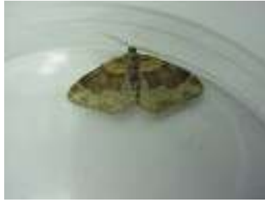
(a) X. ferrugata