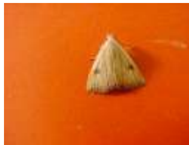
(b) R. sericealis