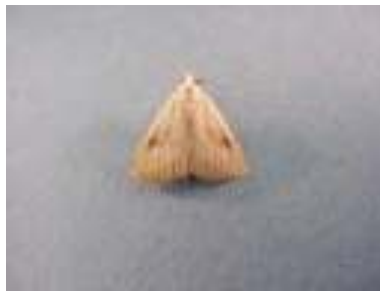
(a) H. grisealis