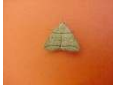
(b) R. sericealis