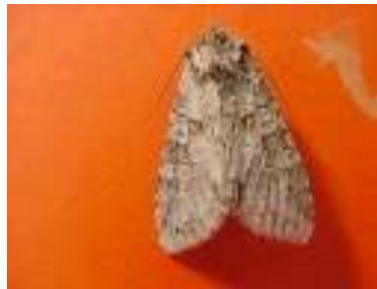
Figure 2. Image of Polia nebulosa .

To illustrate the feature extraction process, consider the image of an individual moth from the species Polia nebulosa , depicted in Figure 2. This image is interesting because the subject is off-centre to the right, which is typical for many of the images in the dataset. There is also some additional noise in the image, namely some distortions in the upper right-hand corner, and the moth has quite a distinct shadow due to the outside (uncontrolled) lighting conditions when the photograph was taken.