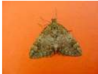
(d) C. truncata