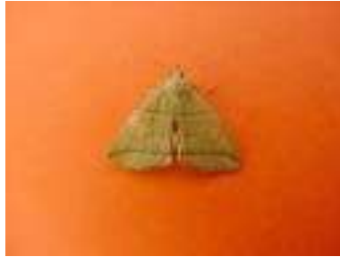
(a) H. grisealis