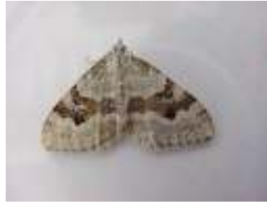
(b) X. montanata