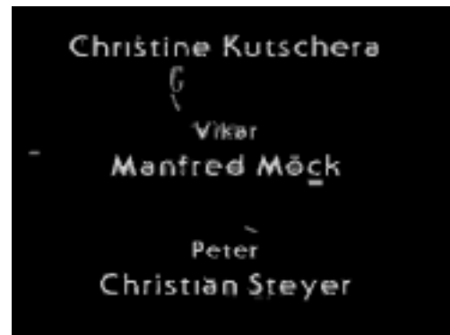
Figure 7: Final segmentation image.