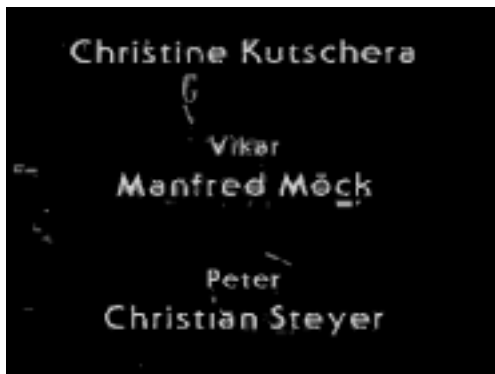
Figure 6: Image result after contrast analysis of Figure 5.

So far, the character candidate regions for each frame have been extracted. The regions are stored in new frames, thereby producing a new video. In these frames pixels belonging to character candidate regions retain their original gray level. All other pixels are marked as background. Segmentation is now finished and the new video can be analyzed frame by frame by any standard OCR software.