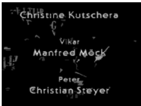
Figure 3: Applying size restrictions to Figure 2.

black, rest = white) and each white pixel is dilated by a circle of a specified radius. As can be seen from Figure 4, the characters and words now constitute a compact region. We frame each connected cluster in a rectangle and define it as block R. If the fill factor is above a certain threshold the block is used for motion analysis. If the fill factor is below a certain threshold, the block is divided recursively into smaller blocks until the fill factor for a resulting block exceeds the threshold. For each resulting block which meets the required fill factor, block-matching motion analysis is performed.