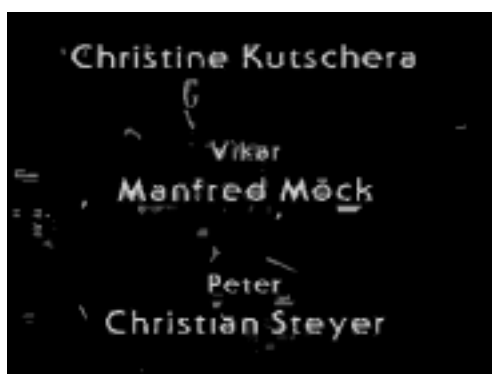
Figure 5: Image result after applying motion analysis to two consecutive frames of Figure 3.

Blocks without an equivalent in the subsequent frame are discarded. Also, blocks which have an equivalent in the subsequent frame but show a significant difference in their average gray tone intensity are discarded. The resulting image is passed on to the next segmentation step (Figure 5).