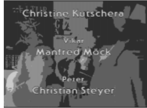
Figure 2: Applying modified split and merge algorithm to Figure 1.