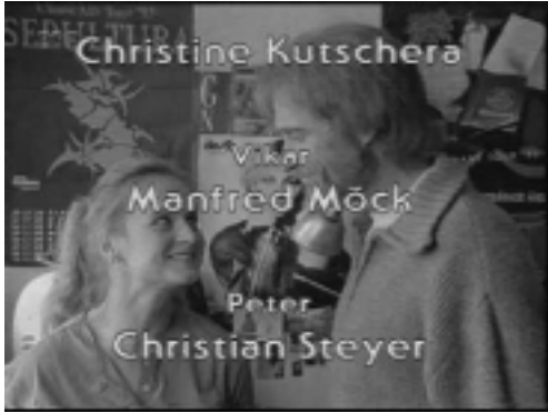
Figure 1: Original video frame.

The segmented image now consists of regions homogeneous according to their gray tone intensity. Some regions are too large and others are too small to be instances of characters. Therefore, monochrome segments whose width and height exceed max\_size are removed, as are connected monochrome segments whose combined expansion is less than min\_size . The impact on our example image can be seen in Figure 3 (deleted segments are black).