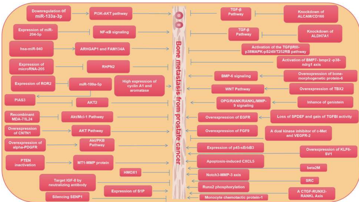
Fig. 2 Different factors that inhibit or promote bone metastasis from PC. Influence of different signaling pathways and drugs on bone metastasis from PC.