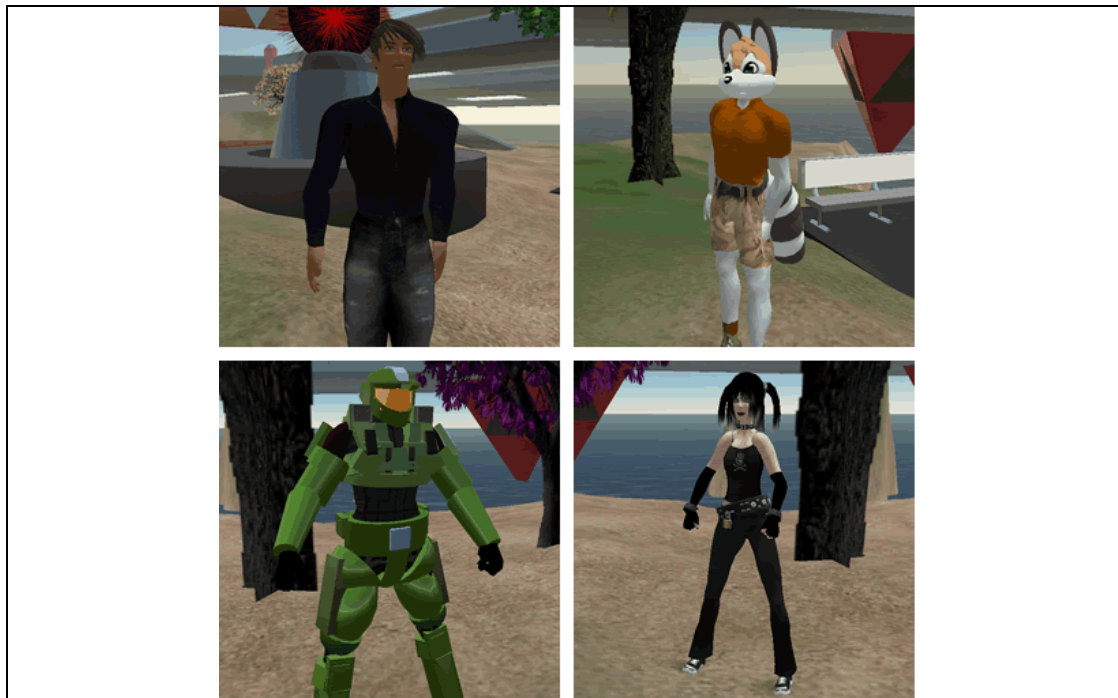
Figure 3. Examples of Avatars Built Within Second Life

Joining a VW usually entails creating a named account and an avatar that will represent an individual person (Ives and Piccoli, 2007). VWs typically provide "stock" avatars to help people get started, but people can modify their avatar's appearance to create dramatically different representations. Figure 3 shows examples of avatar representations that were built in Second Life.