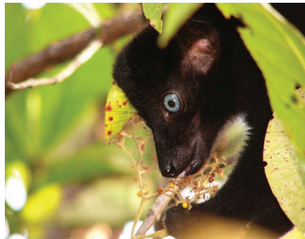
Male blue-eyed black lemur. Eulemur flavifrons in Sahamalaza–Iles Radama National Park.

An International Union for Conservation of Nature (IUCN) Species Survival Commission (SSC) Red List reassessment found that 94% of lemur species are threatened (2) (fig. S1 and table S1), up from 74% in 2008, which makes lemurs the most imperiled group of large vertebrates. Although other large mammals are also under pressure, for the vast majority of taxa in an entire infraorder (Lemuriformes) to be threatened is new, notable, and disturbing. This reevaluation has resulted from both the deterioration of habitat and the recent application of genetic data to phylogenetic analyses