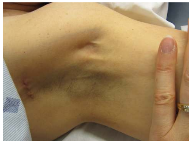
Figure 1 Axillary web syndrome of the left axilla. Note: Multiple cords are visible in the mid axilla.

Patients with less rigid or shorter cords may have minimal cord tension and minimal symptoms until they approach full extension and abduction. In our experience, they frequently describe arm movement as feeling “different” or “not nor-