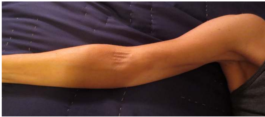
Figure 2 Axillary web syndrome of the right extremity.

Note: Multiple cords are visible in the axilla and medial upper extremity with extension into the antecubital fossa.