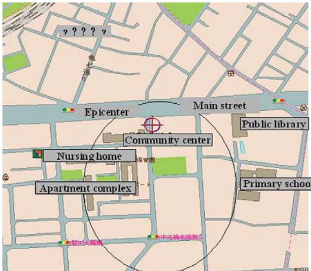
Figure 4. High-risk area for infection, based on foul odor complaints.

may have been caused by heating the medium used to grow B. anthracis or failing to wash the medium from the suspension before dispersal. Geographic distribution of complaints about the odor corresponded with expected dispersal patterns of the aerosol under prevailing weather conditions. Infection risk could theoretically extend beyond the area of the foul odor complaints; however, focusing the telephone survey on this "high-risk" area provided the greatest chance of finding related cases of anthrax. Routine disease reporting by Tokyo-area medical association members did not provide evidence of potentially related cases outside the high-risk area.