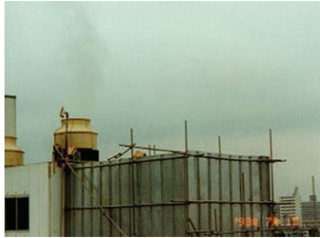
Figure 1. Spraying scenes from the Aum Shinrikyo headquarters building (photographs taken July 1, 1993, by the Department of Environment, Koto-ward).

other syndromes caused by the anthrax bacillus, since the true nature of the mist was not recognized. Reports of short-term loss of appetite, nausea, and vomiting (symptoms not typical of B. anthracis infection) among some residents were the only contemporary evidence of human illness associated with the incident. Vague reports of illness in birds and pets were also noted in local media (1), but the exact nature of these illnesses remained unclear.