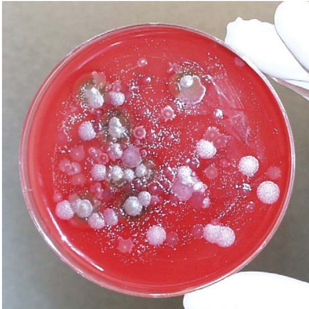
Figure 2. Fluid collected from the Kameido site cultured on Petri dishes to identify potential Bacillus anthracis isolates.

tory illnesses, or hemorrhagic meningitis, which is often a complication of systemic anthrax (5,6) in residents of the high-risk area.