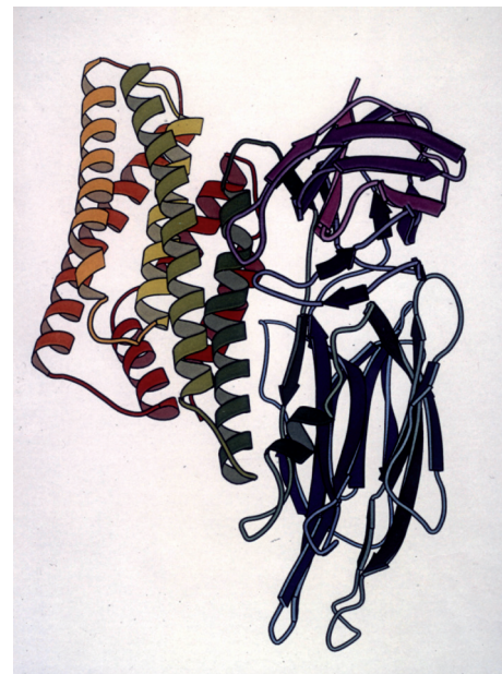
Figure 2. Three-dimensional structure of activated Cry3Aa toxin. Schematic diagram showing the three domains of the protein. (Image courtesy of D.J. Ellar, University of Cambridge, United Kingdom).

tors and this binding is followed by proteolysis, resulting in a conformational change facilitating toxin oligomerization. The resulting oligomers have a higher affinity for the aminopeptidase N-type receptor, and probably for other glycolipid or