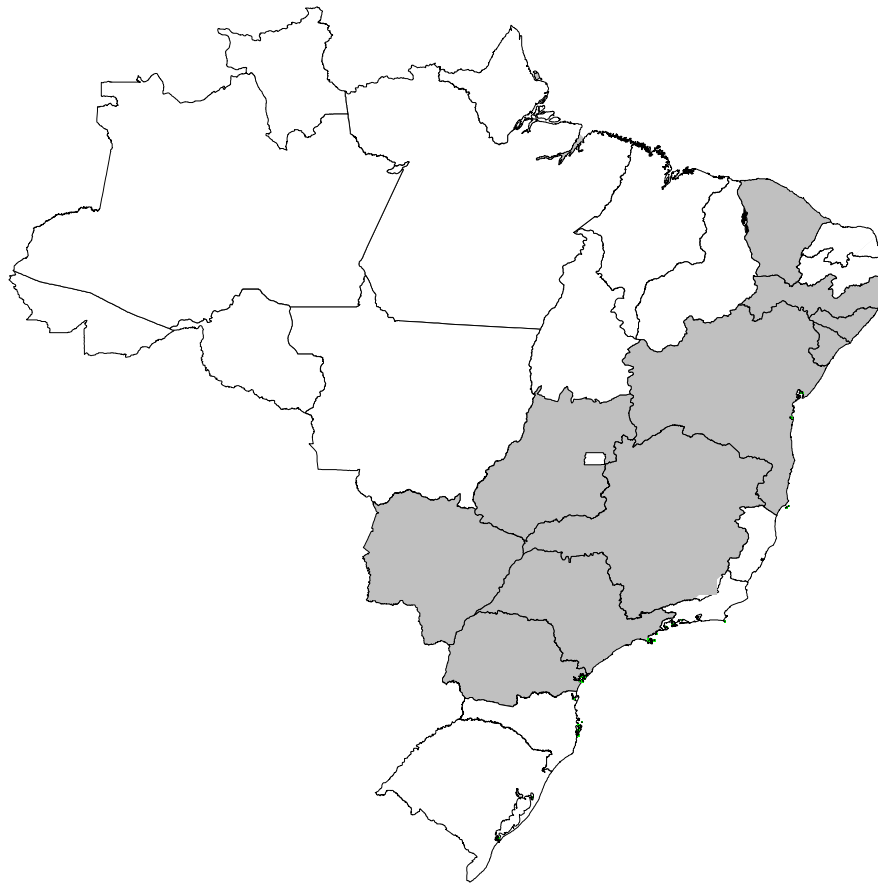
Figure 3. Brazilian states (gray areas) where samples were collected from.

from soil were 3408, with 1758 showing no pathogenic effect against S. frugiperda , 1041 causing less than 20% mortality, and 62 causing 81% to 100% mortality (Table 2). The most frequent isolates were those that appeared to be nontoxic at relatively low concentrations.