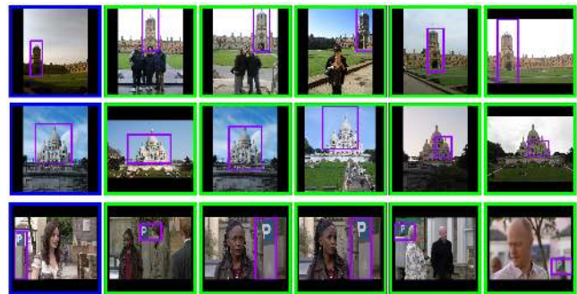
Figure 1: Examples of the top generated rankings for queries of three different datasets: Oxford (top), Paris (middle), TRECVID INS 2013 (bottom).

pipelines that depend solely on CNN features. Current INS systems [11, 22, 23, 24] are still based on aggregating local hand-crafted features using bag of words (BoW) encoding [18] to produce very high-dimensional sparse image representations. Such high-dimensional sparse representations are more likely to be linearly separable, while having relatively few non-zero elements makes them efficient both in terms of storage and computation.