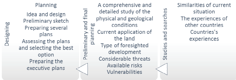
Fig. 2- Process planning construction related to reinforced concrete use in underground structures before the execution of plan

In order to use the model, it has to be implemented, so as a case study a plan to build a secure underground space is studied. Construction plans regarding reinforced concrete use in underground structures include the planning and design stages before the execution stage starts.