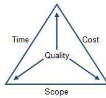
Fig .1- Project management triangle

The balance between cost, time, and quality is one of the most important issues in project management and contractor interest in the project. The main objective of balancing the time and cost of a project is to analyze the sensitivity of project costs in regards to changes of the duration related to activities in order to obtain the best combination of the duration of activities in a way that minimizes total project costs, including direct costs and indirect costs (Zheng and Mao [9]). In fact, the balancing models of time and cost are searching for solutions as optimum allocation of resources to activities, so that in each of these solutions time and costs are minimized (Vanhoucke and Debels [10]).