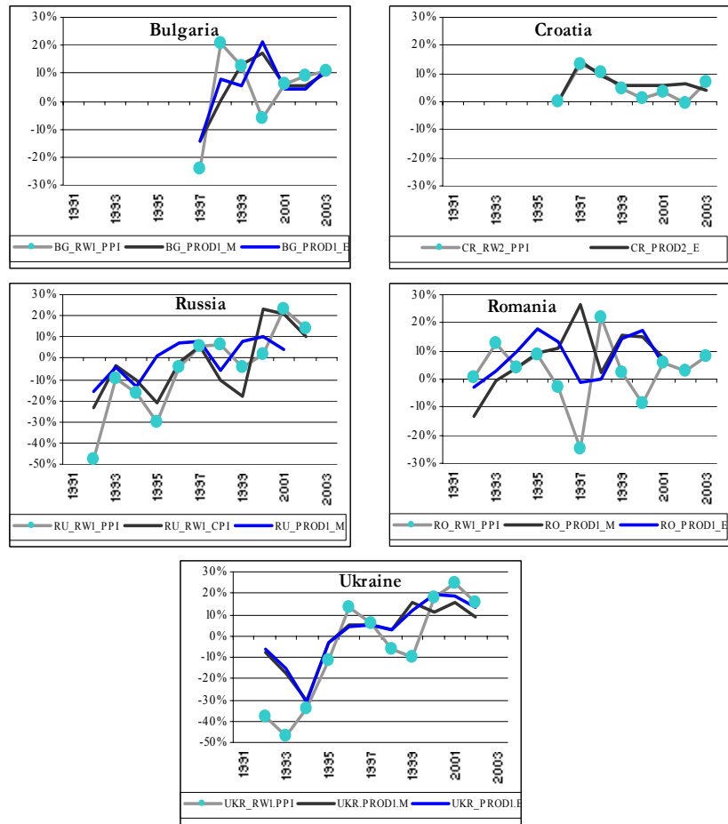
Figure 1. Real Wages and Productivity Growth in the Open Sector

Note: RWI_PPI and RWI_CPI are the PPI and CPI deflated nominal wage in the open sector. PROD_M and PROD_E denote average labour productivity in the open sector using data on employment (M) and on employees (E). The open sector includes industry (PROD1) or industry and agriculture (PROD2).