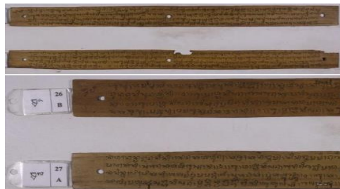
Figure 1. Lontar Wariga Gemet

Lontar (Javanese: ron tal, "daun tal") is siwalan leaf or tal (Borassus flabellifer or palmyra) that are drained and used as a script and handicraft. Lontar are mostly found in Bali besides in Java, Lombok, and Sulawesi islands. Lontar in Bali is used to write about Hindu Religion and cultural heritage of the ancestors [2]. There are many kind of Lontar that are grouped by function and its use. The type of the lontar such as Lontar Yajna, Lontar Wariga, Lontar Puja, Lontar Tattwa and others shown in Figure 1.