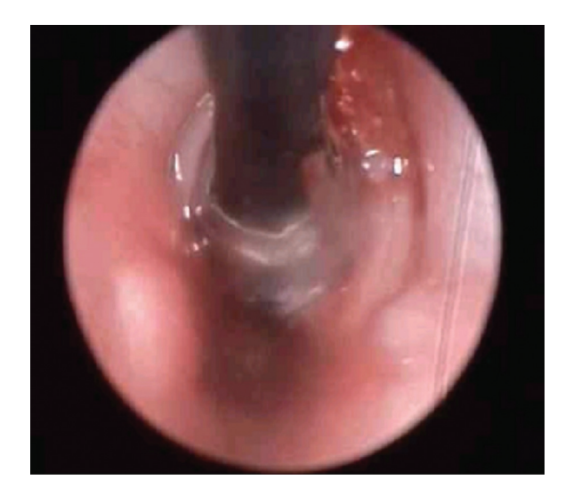
Fig. 2 Laryngoscopy during balloon dilatation.

Table 1 shows the profiles of these patients, including their ages, evolution time, degree of stenosis, number of dilata-