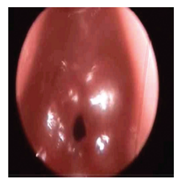
Fig. 1 Laryngoscopy showing stenosis grade III.

As exclusion criteria, the maximum length of time considered for the evolution of stenosis, that is, extubation failures and/ or tracheostomy, had to be less than 30 days (considered acute stenosis), to exclude those patients with delayed stenosis. And the minimum follow-up period after becoming asymptomatic was 6 months.