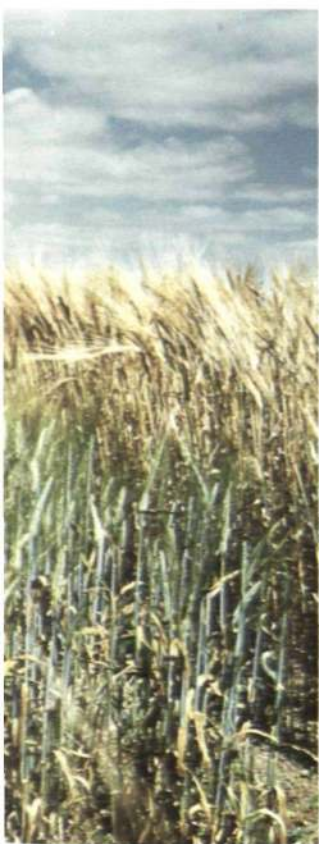
□ Dwarf barley lines and conventional breeding lines. This is part of a selection for later maturing barley lines for higher rainfall areas.

The total area sown to both Clipper and Forrest barley in the State is declining rapidly, with Clipper predicted to account for only four per cent of the planted area in 1986 and Forrest eight per cent. Plantings of Stirling have increased to about 70 per cent of the area sown to barley, while the newer variety O'Connor occupies 10 per cent of the planted area.