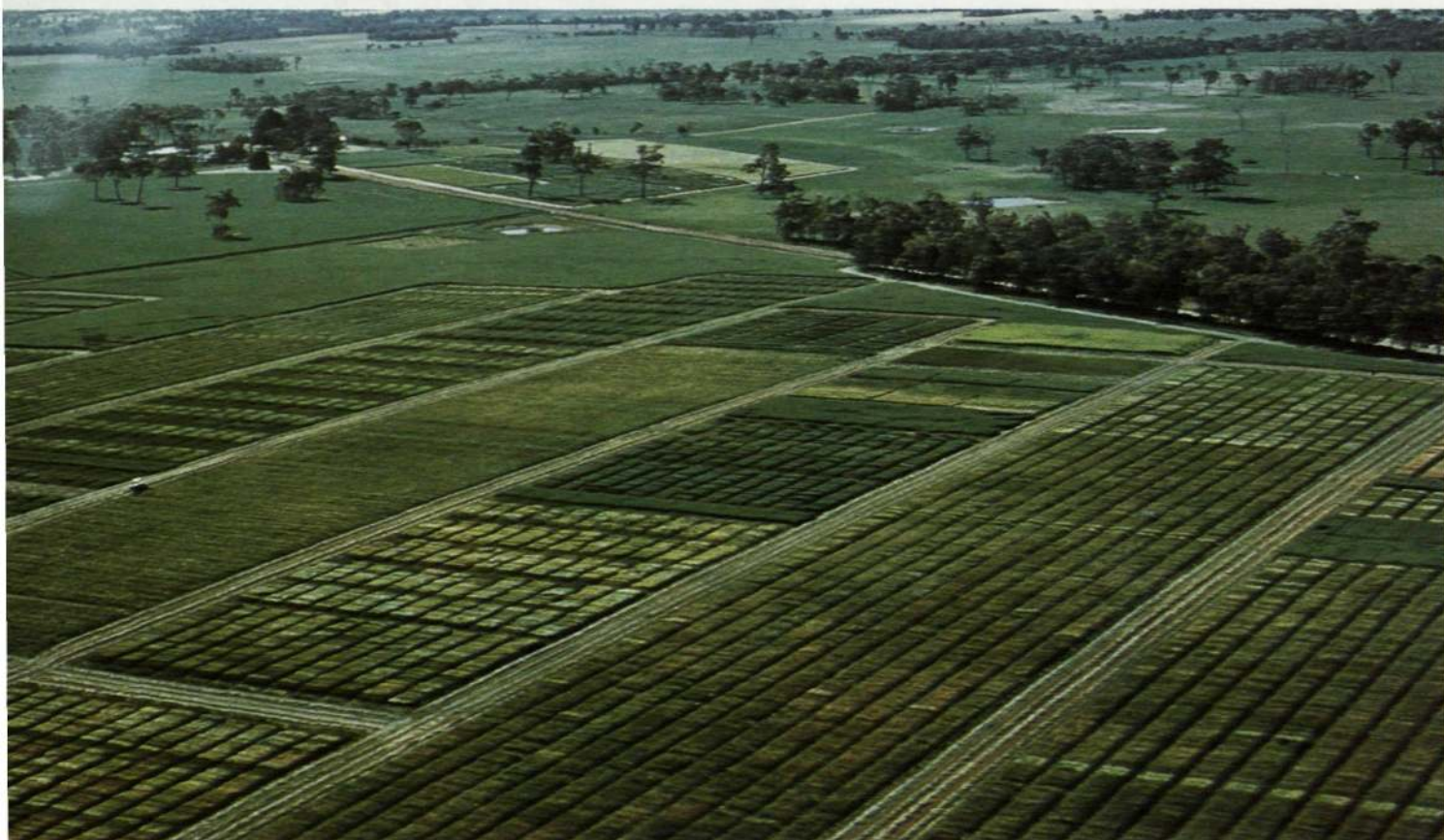
□ Plant breeding yield trials at Mt. Barker—oats, wheat, barley and rapeseed.

tolerance of cereal varieties. The Weed Agronomy Branch in co-operation with district offices have started extensive trials on recommended varieties, allowing testing of herbicides appropriate to the growing area.