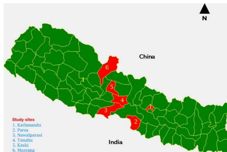
Fig 1. Study sites by geographic region and districts.

This was a qualitative study conducted in six districts in central and western Nepal and follows a standard qualitative research methodology [22]. The study utilized a range of data collection techniques based on the phenomenological approach in qualitative research [23]: Semi-Structured interviews (SSI), Focused Group Discussions (FGDs), and In-Depth Interviews (IDIs) among a range of participants. Twelve FGDs, two each in a district were conducted among 69 community participants (Table 1). Twenty-one SSIs were conducted among government health service providers at various levels (Table 2). Three SSIs were conducted among private health service providers (Table 3) and two among traditional health service providers (Table 4). In-depth interviews were conducted with four patients each in a unique category of treatment (Table 5) and 16 FGDs (eight each in two major TB centres) were conducted among TB suspected patients (Table 6). All participants were purposively selected for the study based