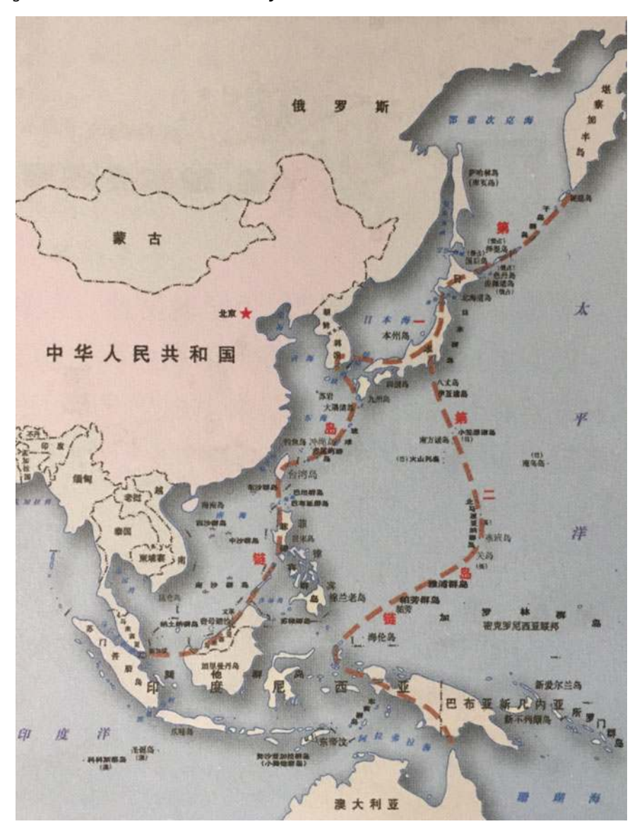
Figure 2: Island Chains in PLA Navy Handbook