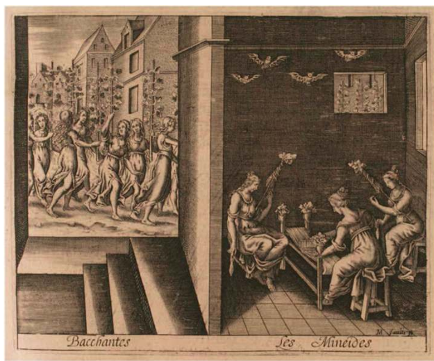
Figure 1. Bacchantes – Les Minéides. Illustration de Les Métamorphoses d'Ovide. Modified from Jean Mathieu, graveur; Ovide, auteur du texte. Editeur: veuve Langelier (Paris) – 1619.

(Translated by AS Kline: www.poetryintranslation.com/ ).