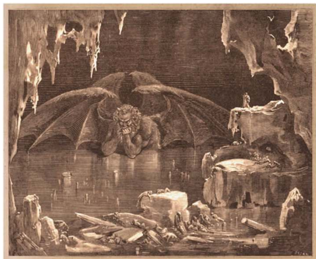
Figure 2. Satan. Modified from Dante Alighieri's Inferno from the Original by Dante Alighieri and illustrated with the designs of Gustave Doré – 1861.

MERS-CoV is phylogenetically related to SARS-CoV and share with SARS-CoV the origin in bats. 23,26,27 Several CoVs have been identified in insectivorous and frugivorous bat species in various countries, indicating that bats may represent an important reservoir of these viruses. 23 MERS-CoV was first identified in Saudi Arabia in 2012 and then spread to other countries causing hundreds of deaths. 26,28 Clinical features of MERS-CoV are similar to SARS-CoV, although this virus has also been associated with several extrapulmonary manifestations, such as severe renal complications. Recent studies have indicated that dromedary camels may be the intermediate hosts and potential source of the virus for humans. 26,29 In addition, the first experimental infection of bats with MERS-CoV has been described. The virus maintains the ability to replicate in the host without clinical signs of disease, supporting the general hypothesis that bats are the ancestral reservoir for MERS-CoV. 30 Human-to-human transmission has also been reported. Based on epidemiological data, both animal-to-human and human-to-human transmission are considered to be important elements in MERS outbreak. 26