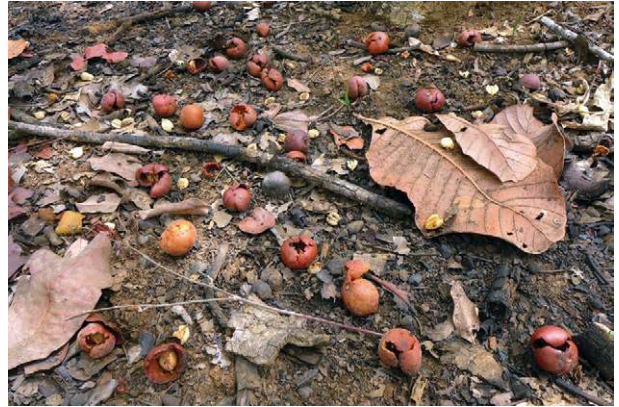
Fig. 3: sugar plum ( Uapaka kirkiana ; Phyllanthaceae) with bat tooth marks on fruits husks, Zambia.

Although bats have been distinct from other mammals for more than 52 million years, bats, carnivores perissodactyls and artiodactyls share part of their evolutionary history that is not shared with other mammals and their ancestors may have co-evolved with ancient lineages of certain viruses. This suggests that they may share physiological characteristics that could facilitate circulation of these viruses. Dobson (2006) visited pig farm sites where outbreaks of Nipah virus infections occurred in Malaysia and found partially eaten fruits with bat teeth marks in them. According to Dobson (2006), pigs may have been contaminated by eating fruits that had been partly eaten by bats and subsequently passed the virus to humans. This hypothesis was tentatively rejected by Fenton et al. (2006) based on the argument that