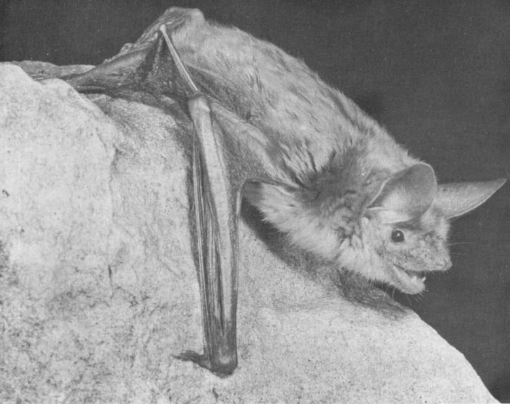
MOUSE-EARED BAT Sdeuard C. Bisseröt

on the lower surface, are now being evaluated in several habitats.