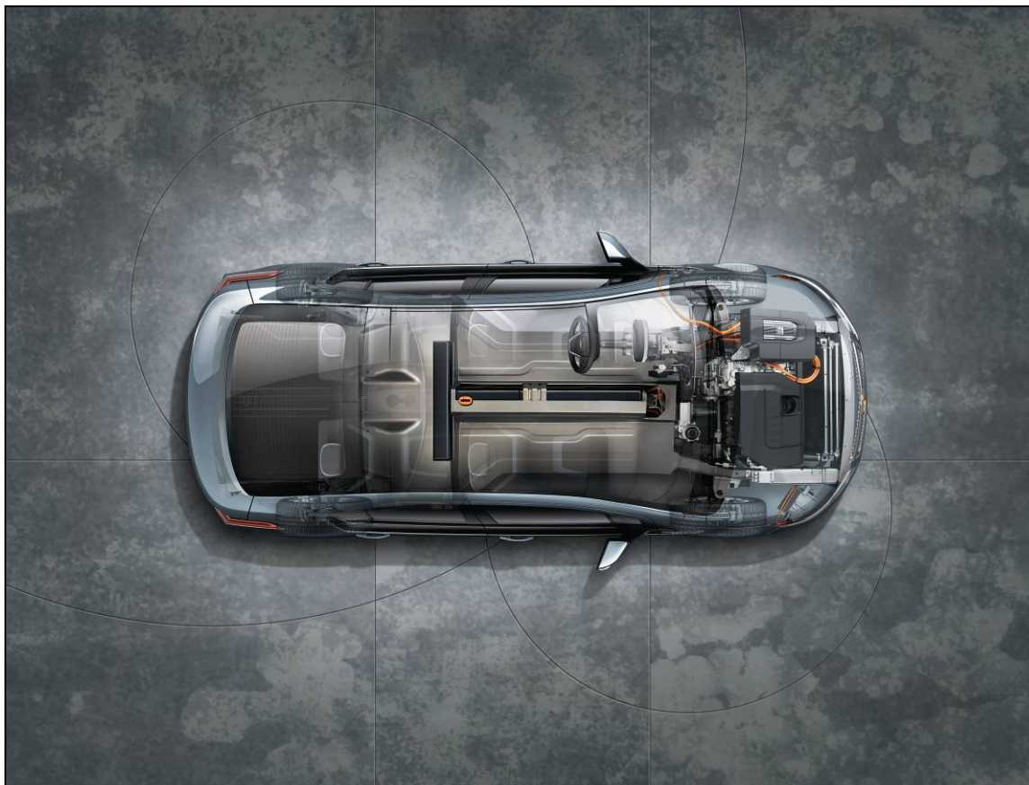
Figure B-1. Overview of the GM Volt