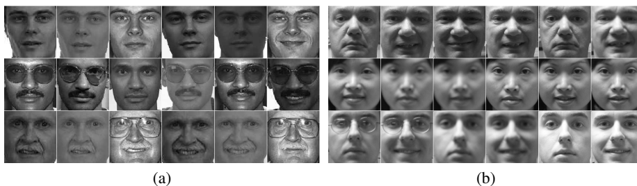
Fig. 1. Face examples of FERET (a) and FRGC (b) databases.

The results are reported in terms of three performance indices: rank-1 recognition rate, verification rate (VR) when the false accept rate (FAR) is 0.001, and equal error rate (EER).