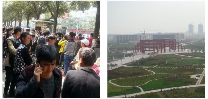
Qianxi bus exploded! My friend witnessed this terrible explosion! How many innocent people have died like this! Capital migration in Xinyang is a foregone conclusion.

To further investigate the existence of suspicious noisy images, we adopt the cross-validation approach to identify them. Specifically, we equally split the original Weibo dataset into 5