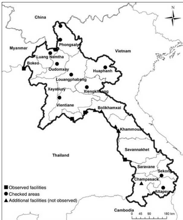
FIG. 1 Locations of so-called bear farms in Lao PDR and of other locations searched during our survey during July–August 2012.