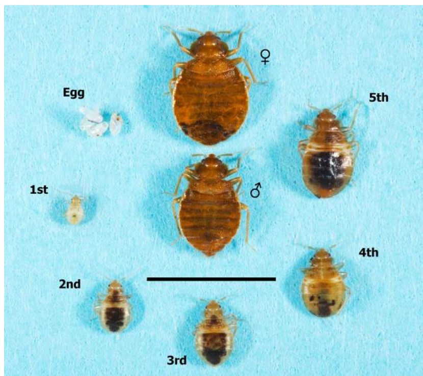
FIG 2 The various life stages of the common bed bug, Cimex lectularius . Bar, 5 mm. Depicted are the egg stage, the five instars, and both adults. All stages were identified according to the key of Usinger (297). (Reprinted from references 95 and 105.)

margin of the pronotum on the thorax of C. lectularius , making the thorax relatively much wider than that of the tropical species (95, 297), although this feature is less obvious in the juvenile stages. In regard to their relative distributions, the tropical bed bug is confined mainly to approximately within the 30° latitudes (98, 102, 104, 216, 217), and the common bed bug is usually found outside this range (102). However, both species may appear beyond their normal ranges (104, 119).