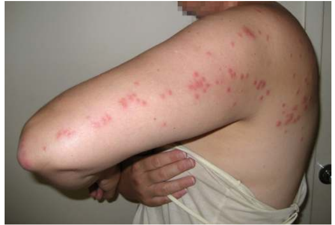
FIG 6 Lines of bites along the arm. The bed bug species was not identified.

181, 182, 266, 279, 288) (Fig. 9). The frequency of bullous eruptions is unknown; it has been stated that they are uncommon (182), but an investigation of bed bug bites on passengers on a tram found eight patients who all developed such eruptions on the legs (172).