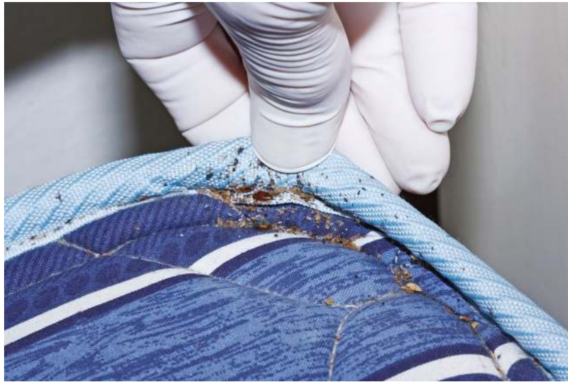
FIG 3 Bed bug infestation on a mattress. People most commonly encounter bed bugs in infested beds. The insects typically harbor along the mattress piping. Various stages can be observed, along with dark fecal spotting.

around 22°C, the life cycle of both species takes around 2 months to complete, and the adult lives for up to a maximum of 4.5 months (58).