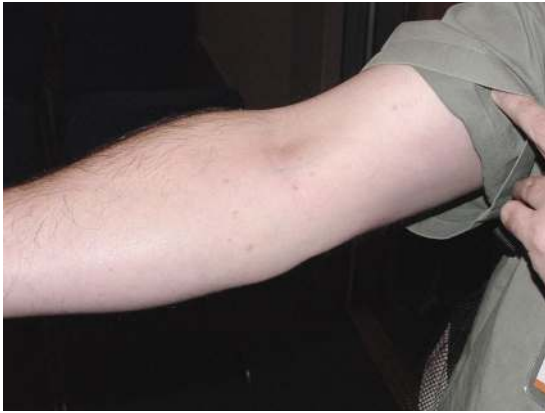
FIG 4 Bite reactions the morning after being bitten by bed bugs. The bites are faint erythematous macules and papules 2 to 3 mm in diameter. The bed bug species was not identified; the bites occurred in a region where both C. lectularius and C. hemipterus occur. (Reprinted from reference 105.)

at the time of the bite (70, 79, 266), but this has not been observed in our experience. If there are large numbers of bed bugs (Fig. 7), the individual lesions can coalesce to give the appearance of a more generalized rash, possibly enhanced by trauma, such as scratching, to the affected areas (Fig. 8), complicating the differential diagnosis (49, 70, 194, 267, 287). If the bed bug infestation is unrecognized or not treated, the cutaneous reactions can become chronic (46, 73), and dermatitis “outbreaks” from bed bug bites have been reported in health care facilities (81). Bite reactions can take some weeks to resolve (130), depending on the severity of the reaction. Patients with multiple bites or a severe cutaneous reaction may develop systemic symptoms, including fever and malaise (182), although this appears to be rare (42).