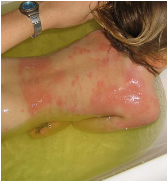
FIG 8 Same patient shown in Fig. 7. A diffused erythema has developed in the more severely bitten areas. This could be the result of trauma (e.g., scratching) to the affected areas.

per and lower dermis around vessels and epidermal adnexal structures, a perivascular inflammatory infiltrate in the papillary dermis, and lymphomononuclear cells and numerous eosinophils around the vessels and between the collagen fiber bundles have all been observed (78). Intra- and subepidermal bullae with an inflammatory infiltrate composed mainly of lymphocytes, histiocytes, and some neutrophils and eosinophils have also been noted (288). However, the correlation of specific histopathological findings with the timing of the initial bites is limited, and further investigation is needed.