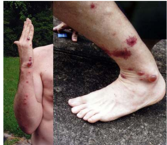
FIG 9 Bullae with hemorrhagic serum on the hands and ankles from the bite of C. lectularius (identified by the authors). These appeared between 24 and 36 h following the bites. The purpuric/necrotic lesions on the ankle indicate the severity of the reaction. (Reprinted from reference 105.)

The largest of the early studies was undertaken at an internally displaced-person camp in Freetown, Sierra Leone (119). Of 221 individuals living with bed bugs, 196 (86%) had wheals from the bites, although it was not stated what percentage of the individuals had previous exposure to bed bugs. The study was further complicated in that both C. hemipterus and C. lectularius coexisted in the camp, and no attempt was made to distinguish the relative clinical reactions from the two species. To date, no study has com-