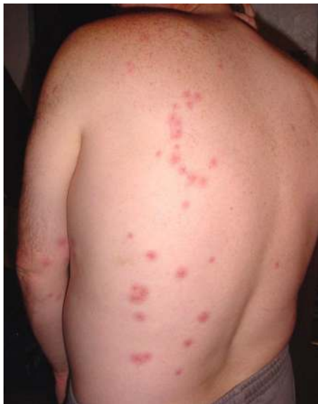
FIG 5 Same patient shown in Fig. 4 but 4 days later. Lines of bites that run along the body can be observed, along with the classic bed bug wheal, measuring 2 to 3 cm in diameter. (Reprinted from reference 105.)

Vesicles and bullae containing clear or bloody exudate that appear some days following a bite have been reported (75, 115, 172,