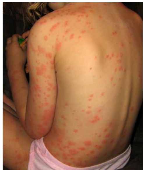
FIG 7 A 4-year-old girl bitten by hundreds of C. lectularius bed bugs (identified by the authors). Multiple discrete bed bug wheals, some with purpuric centers, cover much of the body. (Reprinted from reference 105.)

The immune basis of the clinical reaction is largely uncertain. In one study of 15 patients with papular urticaria, all had IgG antibodies to C. lectularius antigens, although as whole ground dried salivary glands were used as the antigen, the antibody responses to the individual antigenic proteins were not identified (1). Nitrophenol has been shown to induce allergen-specific IgE antibodies in one patient hypersensitive to the bite (181). Similarly, the pathological changes in the skin from a bed bug bite have been poorly studied. Biopsy specimens of the bites show edema present between the collagen bundles in the dermis, with lymphocytes and numerous eosinophils being present around the blood vessels (73). Epidermal spongiosis and inflammatory infiltrate in the up-