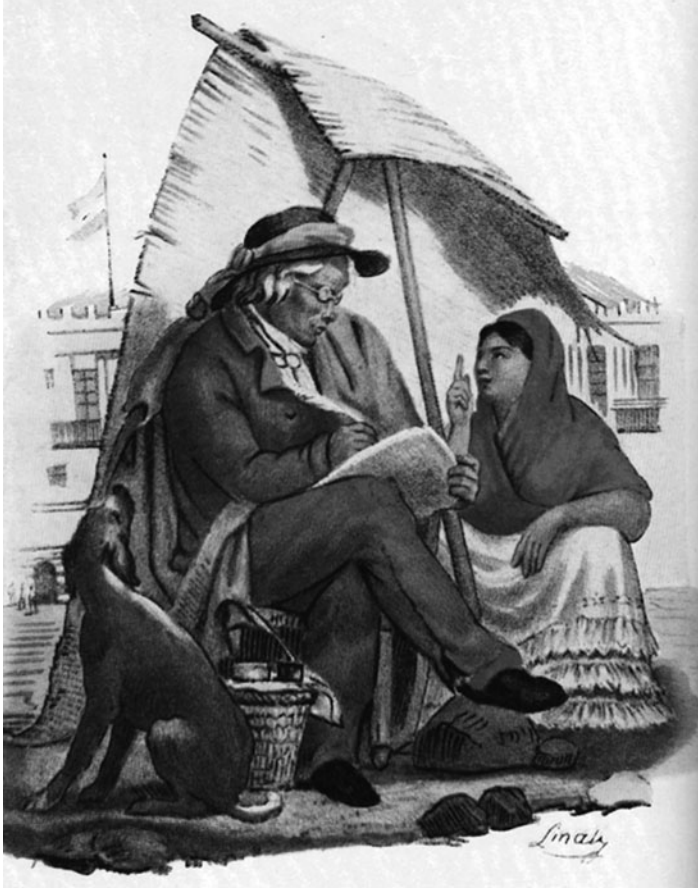
FIGURE 2 Claudio Linati's 1827 rendering of a Mexico City public scribe, whom he describes as holding all of the secrets of the country. "Escribano público" reproduced in Trajes Civiles, militares y religiosos de México (Distrito Federal: Instituto de Investigaciones Estéticas, Universidad Nacional Autónoma de México, 1956), pl. 9.

Their visits to the scribes who lined the streets off city squares were a spectacle that would later capture the attentions of nineteenth-century costumbrista artists. But proximity—whether geographical to courts and legal personnel or cultural to Spanish legal culture—cannot by itself explain what led certain women to sue their husbands and lovers, and this deserves more scrutiny.