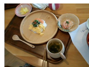
Photo 4. Wood tableware use