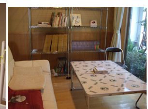
Photo 2. Plastic product use