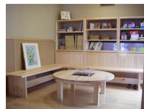
Photo 3. Wood product use