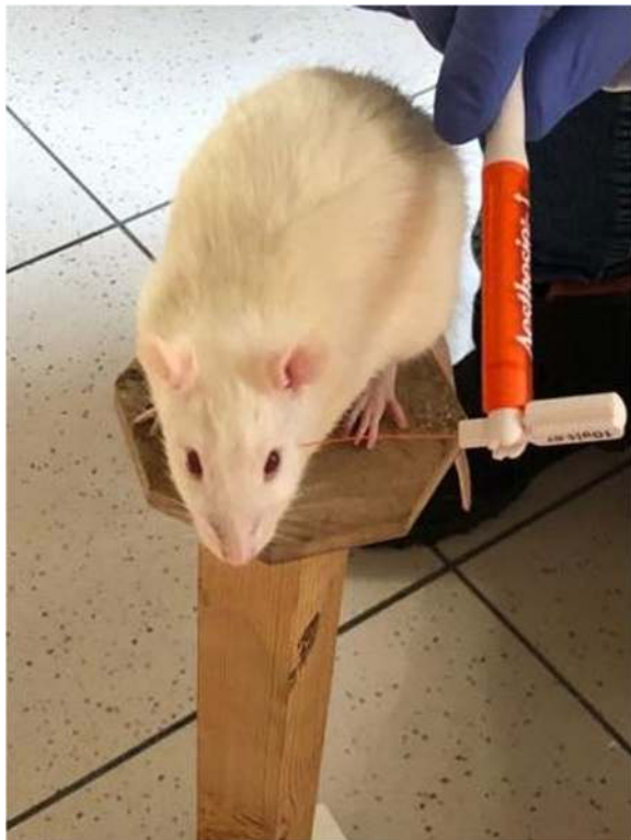
Fig. 3 Representative picture of mechanical allodynia assessment using von Frey filaments in a rat. Application of a filament to the periorbital area is demonstrated

thresholds [34]. Direct application of interleukin-6 (IL-6) produced dose-dependent facial and hindpaw allodynia in rats [36]. Interestingly, 72 h after the injection of IL-6, at a time when the animals had recovered from the allodynia symptoms, IL-6-treated rats became sensitive to usually innocuous triggers such as dural application of a pH 6.8 or pH 7.0 solution, or a systemic nitric oxide donor [37]. In the same study, an intracisternal administration of brain-derived neurotrophic factor produced allodynia and primed the rats to subsequent normally innocuous stimulations [37]. Other drugs could also induce allodynia when applied to the dura: TRPA1 agonists such as mustard oil and umbellulone [8], HIV glycoprotein gp120 [35], pH 5.0 synthetic-interstitial fluid [38], and meningeal TRPV4 activators such as a hypotonic solution and 4 \alpha -PDD [39].