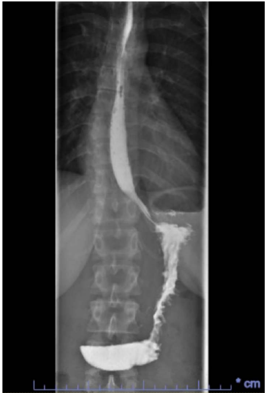
FIGURE 4: Normal upper GI series of the patient