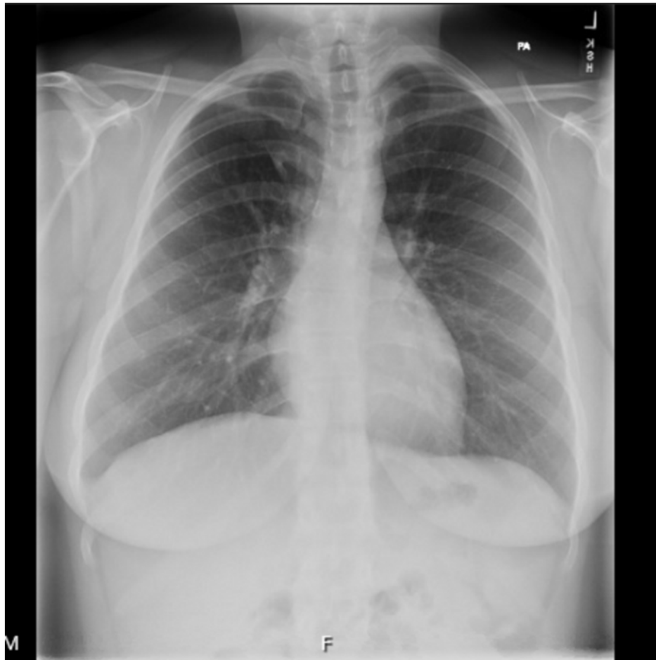
FIGURE 2: Normal chest X-ray of the patient