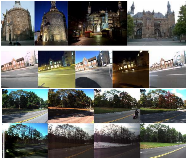
Figure 2. Example query images for Aachen Day-Night (top), RobotCar Seasons (middle) and CMU Seasons datasets (bottom).

from the reference and day-time query images. The scale of the reconstruction is recovered by aligning it with the geo-registered original Aachen model. As in [33], we obtain the reference model for the Aachen Day-Night dataset by removing the day-time query images. 3D points visible in only a single remaining camera were removed as well [33]. The resulting 3D model has 4,328 reference images and 1.65M 3D points triangulated from 10.55M features.