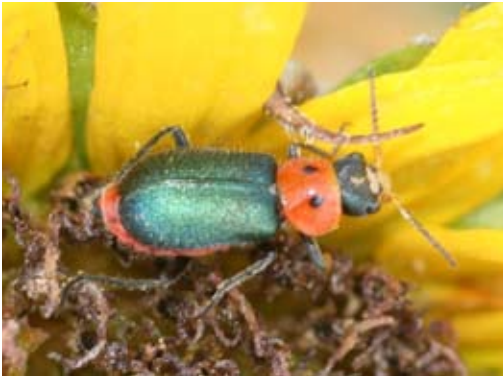
Fig. 14. Two-spotted melyrid adult. 6

Two-spotted melyrid , Collops bipunctatus , is a soft-winged flower beetle in the family Melyridae (Fig. 14). The adult body is widest at the rear and the forewings are relatively soft compared to other beetles. The legs are slender and the antennae are sawtoothed. This beetle has a voracious appetite for aphids. Adults have an orange body with a dark green head and metallic green forewings. The orange "shoulders" have two dark spots.