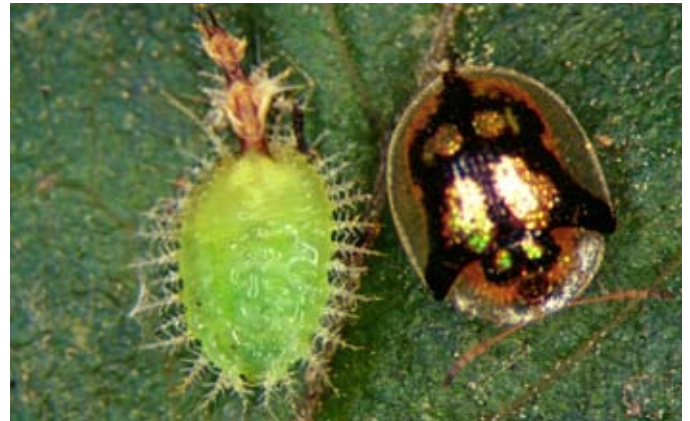
Fig. 12. Tortoise beetle larva and adult. 6

Tortoise beetles are a distinctive group of leaf beetles in the family Chrysomelidae. There are 35 species of tortoise beetles in North America. Adults can be confused with lady beetles because of the turtlelike shape of the forewings (Figs. 12, 13). Adults range from 4-13 mm in length and often the head is completely concealed from above. Adults are metallic and very colorful, ranging from gold to green to yellow. The larval and adult stages eat common weeds, such as bindweed, thistle, horse nettle, and burdock. Sometimes tortoise beetles are considered pests because they also eat sweet potato, tomato, eggplant and a variety of hardwood trees. Two tortoise beetles are used for biological control of weeds: golden tortoise beetle, Metritona bicolor , on bindweed; and thistle tortoise beetle, Cassida rubiginosa , on musk thistle.