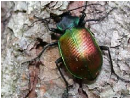
Fig. 4. Ground beetle adult. 5

The ground beetles are a large group of predatory insects in the family Carabidae. Adults and larvae are considered beneficial and will eat almost any type of insect, including: caterpillars, root maggots, snails and other soil dwelling insects. There are more than 3,000 different kinds of ground beetles in North America and they range from 6-30 mm in length. Many will have a solid, shiny black body with hardened and ridged forewings (Figs. 4-6). Some ground beetles have a black body and iridescent red, purple or green markings on the forewings. Most ground beetles have a relatively long body, flattened head, threadlike antennae, and long legs. Sometimes adults can have enlarged mandibles for grasping prey. As the name suggests, adults prefer to run on the ground and rarely fly. In general, adults are actively hunting on the ground at night and hide under rocks or debris during the day.