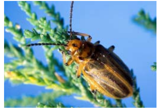
Fig. 15. Saltcedar leaf beetle. 11

Saltcedar leaf beetle , Diorhabda elongata , is a leaf beetle in the family Chrysomelidae (Fig. 15). This beetle is native to China, but was introduced into Utah to control saltcedar, or tamarisk. Adults are 5-7 mm long with alternating black and greenish stripes on the forewings. Both the adults and larvae are beneficial, eating saltcedar vegetation.