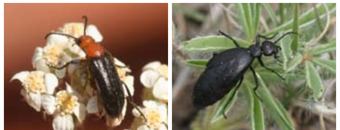
Figs. 8 and 9. Blister beetle adults. 6,6

Blister beetles are in the family Meloidae, and more than 300 species are found in the U.S. A common species in Utah is the spotted blister beetle, Epicauta maculata . Often blister beetle adults will have obvious "shoulders" that are wider than the head. Adults are relatively soft bodied and long legged compared to other beetles (Figs. 8, 9). Blister beetle adults range from 12-19 mm in length; forewing coloration varies greatly between species. Larvae are considered the beneficial stage, often eating grasshopper eggs. Unfortunately, larvae and adults secrete cantharidin, a poisonous chemical that can blister skin or cause painful swelling. Blister beetles are of economic concern when they feed in alfalfa hay. Consumption of blister beetle larvae by cattle or horses can cause serious illness or death. Hay and forage fields that have significant blister beetle populations should be cut pre-bloom and/or avoid conditioning prior to baling.