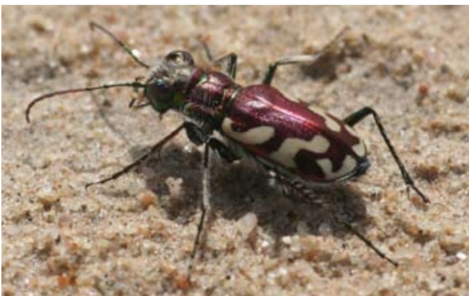
Fig. 11. Crimson salt flat tiger beetle adult. 6