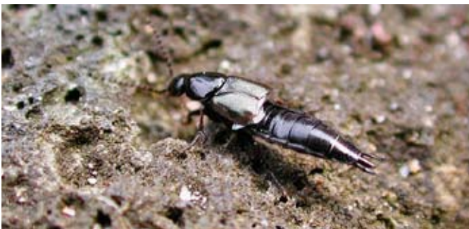
Fig. 7. Rove beetle adult. 7

Rove beetles are another large group of predatory insects. Rove beetles are in the family Staphylinidae and more than 3,000 different species are found in North America. Rove beetle adults and larvae are predators of other insects, but will also eat decaying vegetative matter. The adults are very easily distinguished from other beetles because they have shortened forewings that expose the end of the abdomen (Fig. 7). Although rove beetles can fly, the adults are more often seen running on the ground. Adults are shiny brown or black, have enlarged mandibles for grasping prey, and range in size from 2-20 mm in length. Rove beetles can be found under rocks or wood, or around mushrooms or other decaying vegetation. Some rove beetles display a defensive behavior, similar to scorpions when disturbed, of raising the abdomen in a defensive posture.