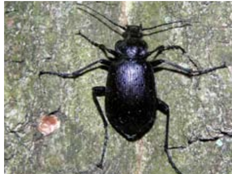
Fig. 5. Ground beetle adult. 5