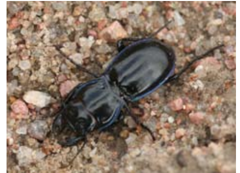
Fig. 6. Ground beetle adult. 6