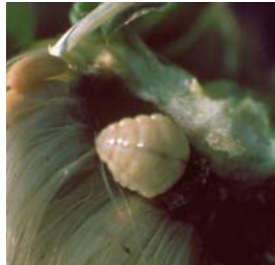
Fig. 16. Thistle-head weevil adult. 6 Fig. 17. Thistle-head weevil larva. 10

Thistle-head weevil , Rhinocyllus conicus , is a weevil in the family Curculionidae (Figs. 16, 17). This beetle is native to Europe, Africa and Asia, but was introduced into North America for biological control of musk (nodding) thistle. Adults are 10-15 mm long and are yellowish brown in color with a pronounced snout. Mated females lay eggs on the bracts of musk thistle flower buds. Larvae are the beneficial life stage, eating the developing thistle seeds.