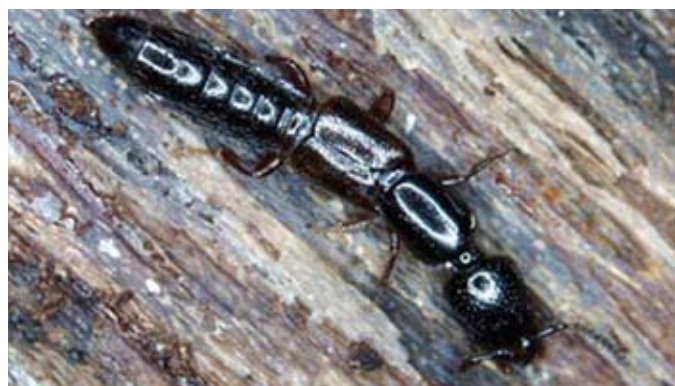
Fig. 2. Rove beetles can be beneficial insects. 2