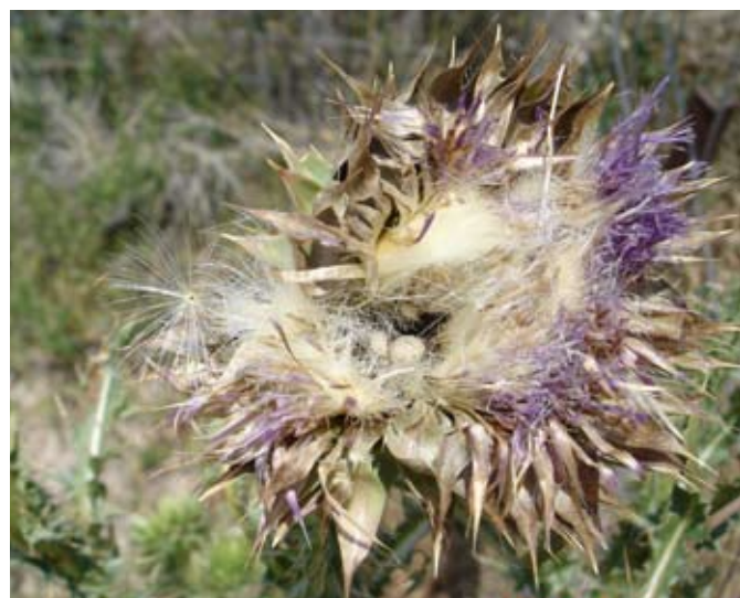
Fig. 1. Musk thistle is readily eaten by beneficial insects like thistle-head weevil larvae. 1

There are many beneficial beetles in Utah besides lady beetles or ladybugs. Beetles can significantly reduce common insect and weed problems and in some cases eliminate the need for chemical control. Examples of beneficial beetles include: ground beetles, rove beetles, tiger beetles and tortoise beetles. Many of these beetles are native to Utah, while others have been purposely introduced to help control damage from exotic insect and weed pests (Figs. 1, 2). As with most beneficial insects, there can be negative side effects or consequences associated with too many insects in a given area. But in general, beneficial beetles suppress persistent insect problems.