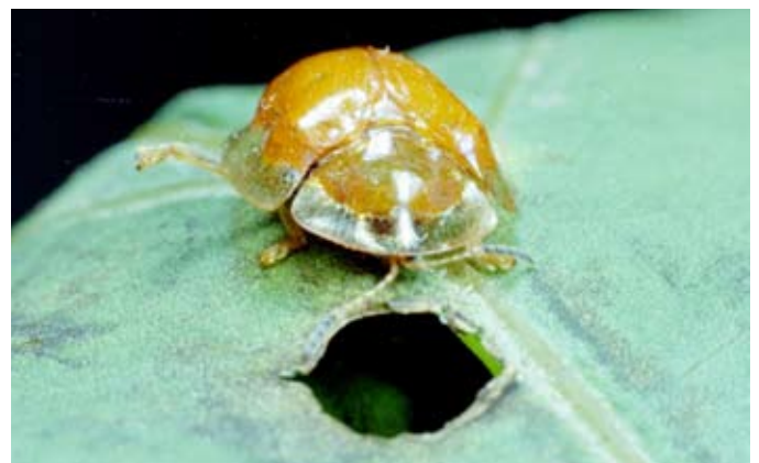
Fig. 13. Golden tortoise beetle adult. 9