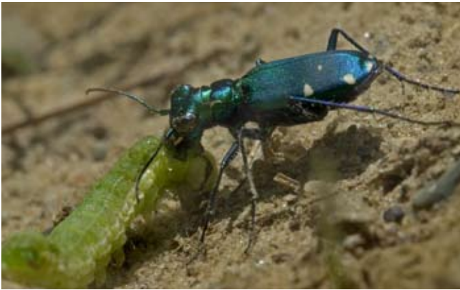
Fig. 10. Six-spotted tiger beetle adult attacking a caterpillar. 8

Another group of predatory insects are the tiger beetles in the family Cicindelidae. There are at least 200 species of tiger beetles in North America and they are closely related to the ground beetles. Adults and larvae are predatory and will consume almost any type of insect. Tiger beetle adults are often brightly colored metallic blue, green, or orange, and range from 10-20 mm in length (Figs. 10, 11). Adults have long legs and are quick runners. Tiger beetles are considered ambush feeders and will seize prey with powerful sickle-like mandibles. The S-shaped larvae construct vertical burrows in dry soil and wait for prey to fall inside. Tiger beetles have one generation per year and commonly hunt during the day in gardens, stream edges, forests and deserts.