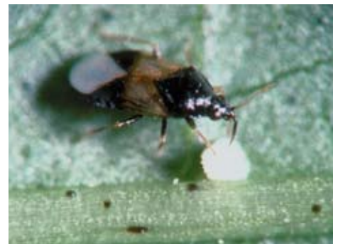
Fig. 9. Minute pirate bug adult feeding on an insect egg. 5