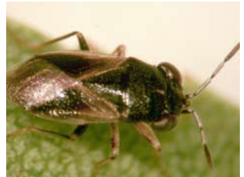
Fig. 7. Bigeyed bug adult. 4