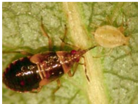
Fig. 8. Minute pirate bug nymph feeding on an aphid. 4

Anthocoridae are small predatory bugs, with about 600 species in the world. Adults range from 0.5-6 mm in length and have dark bodies with black and white forewings (Figs. 8-7). Minute pirate bugs have oval bodies that are somewhat flattened. Adults have large, prominent eyes. These predators are found in ground litter and grass, and attack insect eggs, aphids, scales, and spider mites. Minute pirate bugs are also released into greenhouses for biological control.