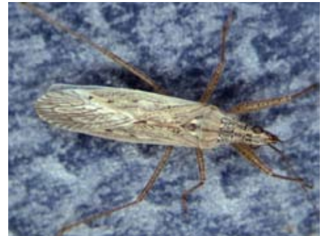
Fig. 13. Damsel bug adult. 2