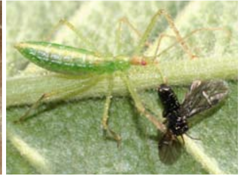
Fig. 5. Assassin bug nymph feeding on a leafminer fly. 2