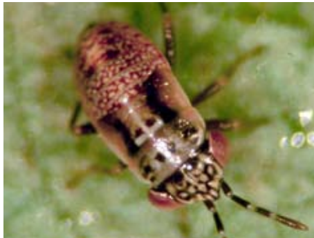
Fig. 6. Bigeyed bug nymph. 4

Geocoridae is a small family of predatory insects, with only 275 bigeyed bug species in the world. Adults are brown or black in color, and range from 3-5 mm in length. Adults have a triangular head with large, prominent eyes that occasionally extend over the back (Figs. 6-7). These predators are commonly found on weeds, sparse grass, in woods and near streams. Prey items include eggs, caterpillars, leafhoppers, mites, thrips, whiteflies, and aphids. Sometimes bigeyed bugs are mistaken for chinch bugs or other pests.