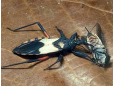
Fig. 4. Assassin bug adult feeding on a fly. 3

Reduviidae is a large family of assassin bugs with more than 7,000 species in the world. Adults range from 4-40 mm in length and are brown, black, red or orange in color. Most assassin bugs have an elongated head accentuated by a narrow neck, long legs and an obvious curved piercing stylet or beak (Figs. 1, 4-5). Another distinctive trait is the tip of the beak fits into a groove of the thorax and rasps against ridges to produce sound. Assassin bugs eat a variety of prey, including grasshoppers, beetles, flies, bees, and other plant-eating true bugs.