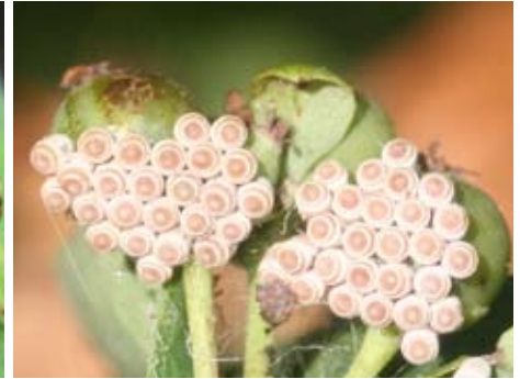
Fig. 11. Stink bug eggs. 2