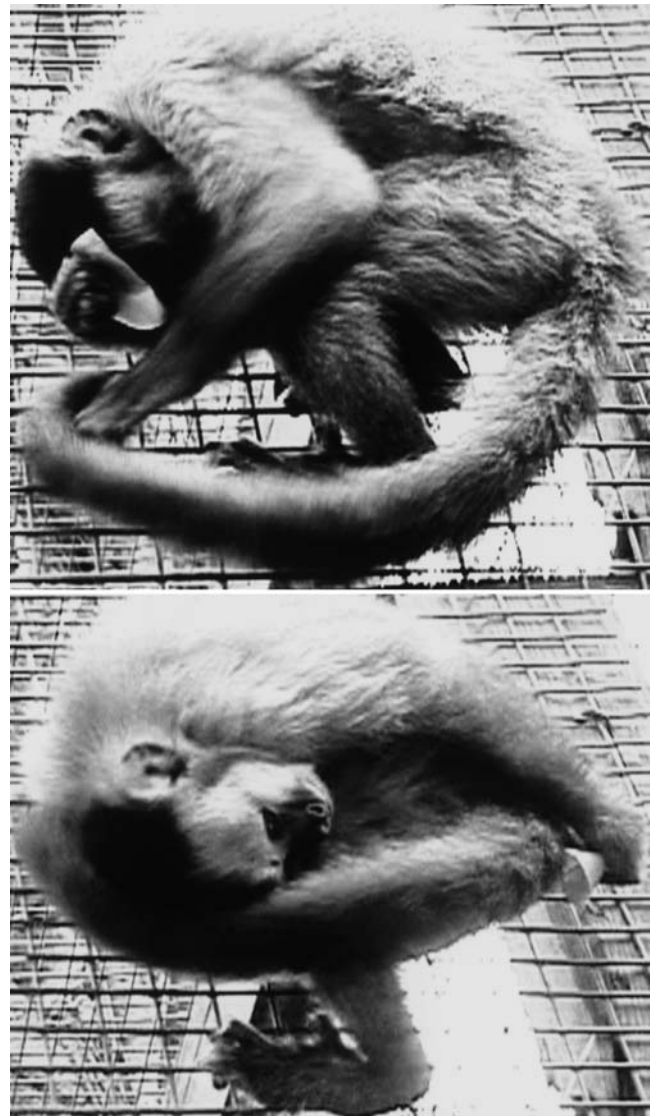
Fig. 2 A Cebus apella rubs a filter paper treated with toluquinone against its head (top), then, reaching back, against the base of its tail

Benzoquinones elicited energetic anointing in monkeys, whereby they wiped the treated filter papers against themselves; rubbed their fur with hands, feet, and tail; and