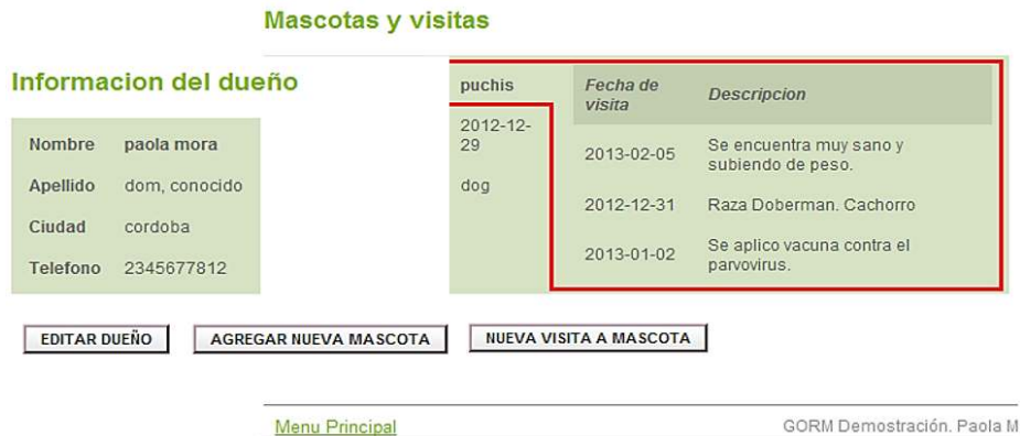
Fig. 4 Web Application using ORM with Grails

There are common problems with the development of Web-based projects such as: 1) developers frequently make the same mistakes in the development phase, which implies spend time and money, 2) spending huge amounts of time and money training new team members, 3) having difficulty with multi-person projects because each team member has his own way of doing things. In order to avoid these problems, this work intends to moti-