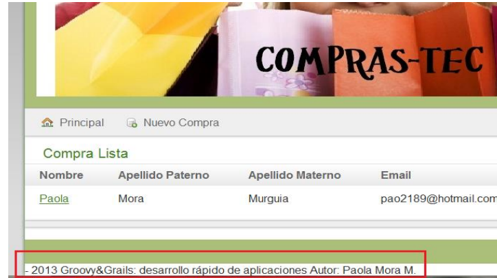
Fig. 2 Grails-based Web Application using templates.

In Fig. 3, an example of employing the Comet support by using a Web chat for the ESPN web site is shown. This example represents a Grails-based Web application which allows multiple conversations/interactions with students. The Atmosphere plugin is used and with this feature Web application is busy, dynamic and interactive.