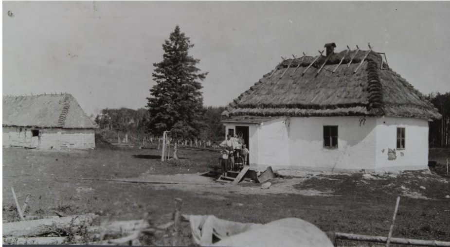
Figure 1. Ethnic architecture in Manitoba as documented in Ledohowski and Butterfield's Architectural Heritage in the Eastern Interlake Planning District (1983). The figure shows a Ukrainian farm in Fraserwood, 1915, illustrating an example of a typical second home in the Interlake region (p. 68). The study of vernacular architecture has played a foundational role in creating ethnic identities across North America. For good overview, see Noble, To Build in a New Land.

Oliver, J. & Edwald, Á (in press). Between islands of ethnicity and shared landscapes: rethinking settler society, cultural landscapes and the study of the Canadian west'. Cultural Geographies . DOI: 10.1177/1474474014561576