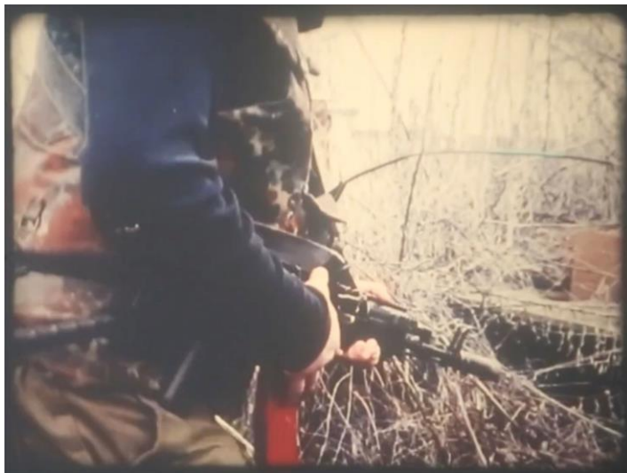
Figure 1. Bear in the trench.

Drawing from this experience, I made a 16mm film, patrol (Ploeger 2017) 1 , which consists of footage I recorded with my smartphone during the trip and subsequently transferred to celluloid film. It shows fragments of my foot journey with three soldiers, known under their noms de guerre as Bear, Carpenter and Steinar. The two-minute long film shows how we move from a safe house on the edge of the no man's land to a frontline outpost opposite a separatist position, while installing a communication cable through an unfinished trench (figure 1).