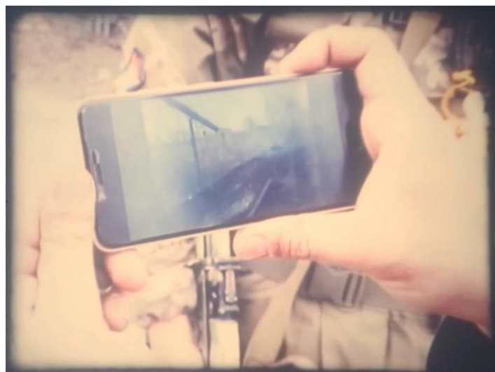
Figure 3. Steinar and Carpenter showing a video of their explosion on a smartphone.

break. Shortly after, they return and proudly show us a video of the explosion on one of their smartphones (figure 3).