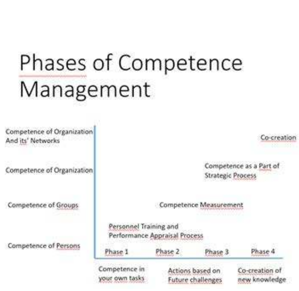
Figure 1. Phases of Competence management (SALOJÄRVI, 2009). HAMK’s goal is to be in phase 4, where co-creation is a way of working, and we are also using our networks’ competences to reach our strategic goals. In this phase, the organisation is also capable of creating new knowledge.

To succeed, it is very important to do things systematically. That is why every year managers at HAMK go through performance appraisal processes; and in those meetings, one of the focus points of discussion is competence development. After this performance appraisal process, every teacher has their own development plan. This development plan also includes projects, research and internationalisation actions in which the teacher is planning to take part in. When the development plans are written, it is much easier to choose the right parts from different kinds of competence development tools, which HAMK as an organisation also offers. Change is the key word when we talk about competence management. One of the main reasons why higher education teachers are successful in changes is that teachers are able to learn new practices while developing them (KUNNARI, 2018).