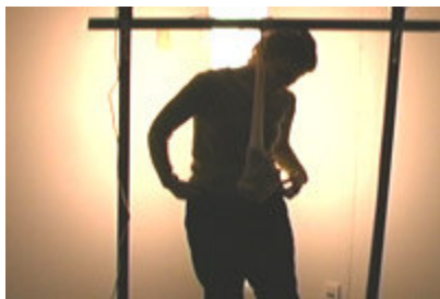
Figure 2: Emphasizing robot-fetus connection

Overall, the visual design of the project was effective, and quite close to how I had envisioned the installation. This was particularly important as it was important to make the visual connection with Geddes' photographed babies. The nylon environment, though delicate to work with, reinforced the union between a technology (in this case the chemical technology of nylon) and women's everyday experience (the nylon stocking being, for the most part, a uniquely female wardrobe item.) The relative fragility of the robot structure also provided a nice parallel to the infant model.