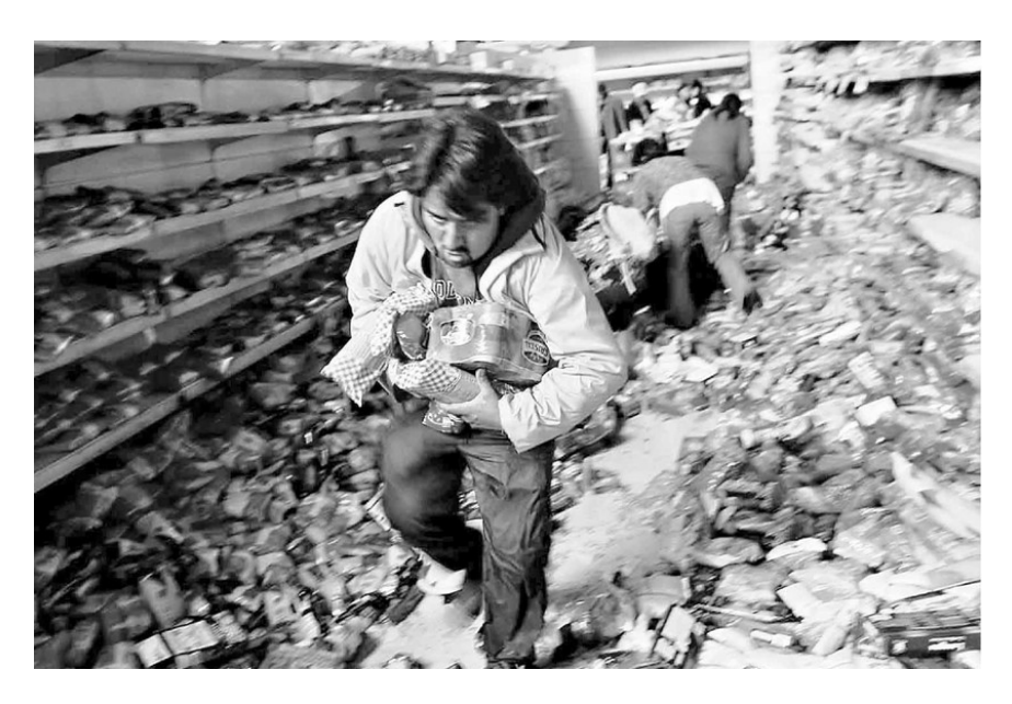
Figure 3. In the aftermath of the earthquake, the media circulated images of 'looters' obtaining food and luxury goods.

BBC News 2010b). Often imagined as irrational, drunken, lazy and rebellious (and recently as terrorists) in the dominant racist popular imagination, Mapuche are subject to heavy-handed policing tactics that approach martial law (Waldman 2012). If like other indigenous peoples, the Mapuche are often imagined as backwards enemies of modernity and too close to nature (Franco 2006; Terwindt 2009), the earthquake was imagined as having the power to reduce non-indigenous Chileans to the same "condition of mere nature," to quote Hobbes (1994 [1668]). Citizens in affected areas were in fact often imagined by government as out of control, like the Mapuche—even while, paradoxically, they were also imagined as potential victims of their out-of-control neighbors—and thus many non-indigenous citizens were briefly subject to the kinds of state policies directed at the Mapuche. In sum, the practices authorized by the State of Catastrophe borrowed not only from Pinochet era but also from earlier regimes and from contemporary (neo)colonial strategies of government.