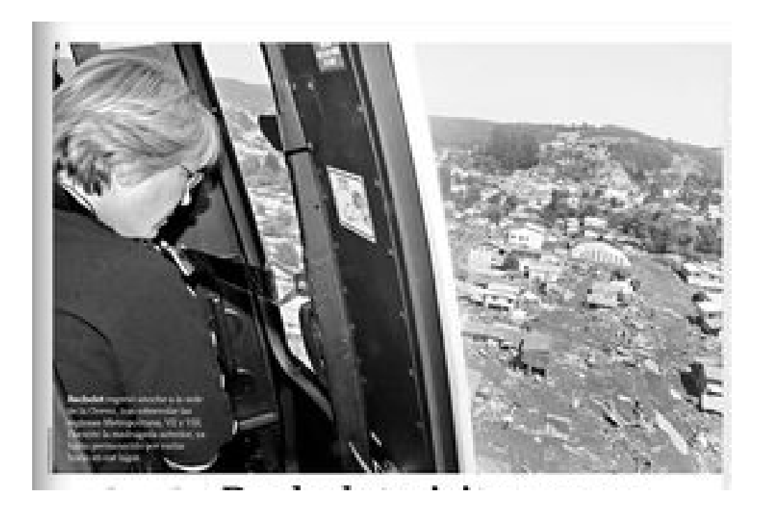
Figure 2. President Bachelet surveys the damage from a helicopter after the 2010 earthquake.

The dualistic pairing of Managerial State and Manageable Nature was reinforced in other media representations. Figure 2 shows an image that was widely distributed beginning on the evening of the disaster. While the photograph undeniably captures an important moment, an image of a president is always symbolic of the state and especially so in the context of national disaster. Emblematic of the Managerial State, the depiction of the president gazing down on the country from a government helicopter evokes the kind of knowledge-making and control to which modernist planners and bureaucrats aspire (Scott 1998). The relative strength of the state compared to the natural disaster is also reflected by the juxtaposition of the clearly defined president on the left of the photograph and the washed out (natural) landscape below and to the right. Bachelet's facial expression reveals what might be imagined as the appropriate affect of the managerial state: calm concern. Whatever actual effects this image may have had on individual viewers—who each would have interpreted it from their own unique points of view—the structure and content of the image is consistent with the vision of state and nature that circulated immediately after 27F.