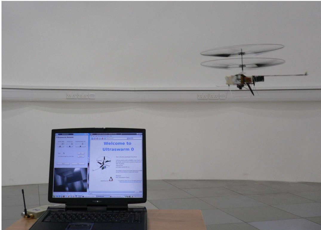
Figure 5. This shows a modified Proxflyer machine, with camera and Gumstix board, hovering in the arena. It is being remotely controlled via the Bluetooth link from the ground based computer – the control interface is visible in the top left of the screen, and the relatively large and heavy aerial can be seen pointing downwards from the body of the helicopter. The bottom left of the screen shows the view from the camera. The right half of the screen shows a web page served up over the Bluetooth link by the web server running on the Gumstix board.