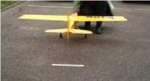
Figure 1. The Flying Gridswarm prototype, shown with a 30cm ruler.

real-time range and bearing information necessary for flocking were to be provided initially by individual beacons carried on each aircraft, coupled with complex directional receiving aerials, but in the longer term we expected to migrate to purely vision-based flocking. (Air-to-air video sequences of other aircraft shot from the WOT4 show this to be challenging but probably feasible.) As part of the project, a detailed dynamic simulation of a flock of WOT4 aircraft was produced [10]; this enabled an assessment of the relationship between the aircraft's dynamics, the control system, and the constraints (such as viewing angle) imposed by a practical vision system.