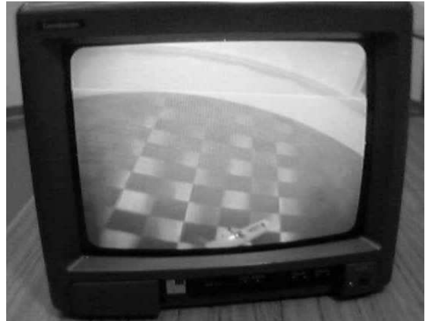
Figure 3. The camera's view of the arena from a height of almost 6m.

Since the ground-based computer system has information about the positions and orientations of all the helicopters, and since the speeds of the helicopters can be estimated from their previous positions, all of the information required can be processed and passed to each helicopter via the communications link.